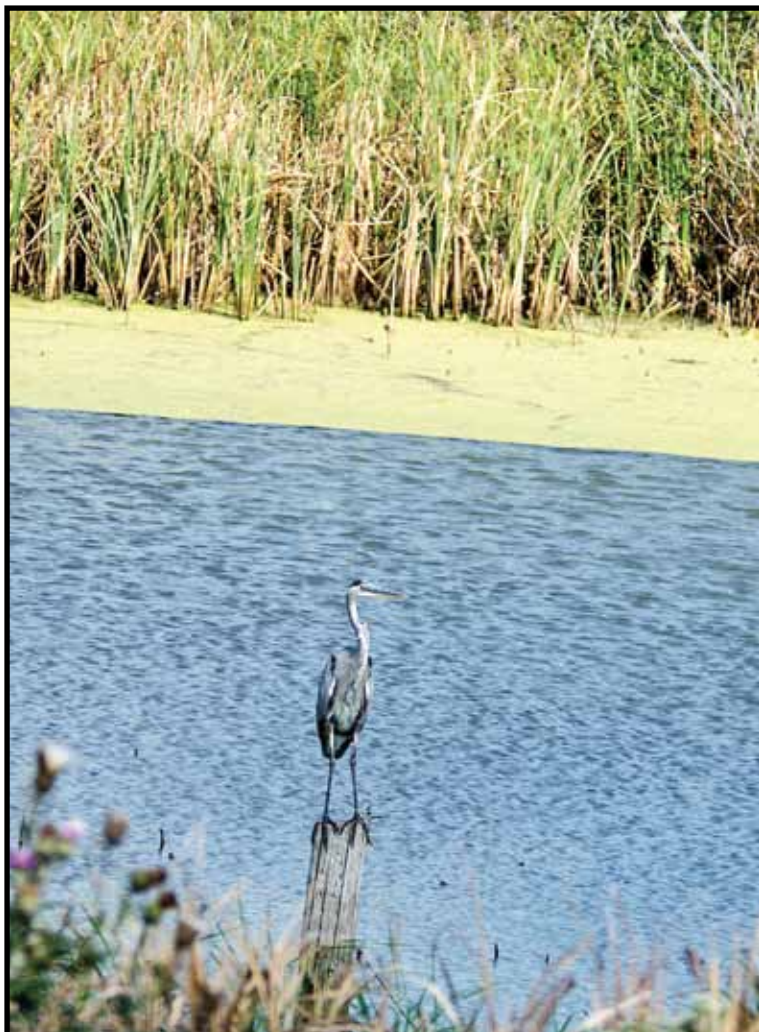
Great Blue Heron near Brownville