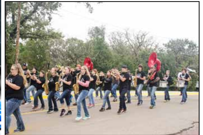
Thank You, Nodaway-Holt Trojans!