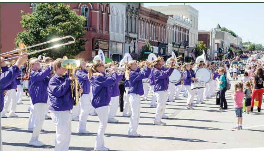
The Blair, Nebraska, band always makes a good impression at AppleJack!