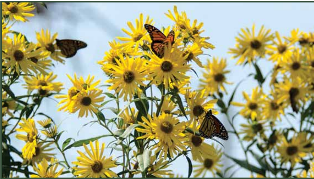
Monarch migration through Southeast Nebraska peaked around the first day of Autumn and ended with the last of the 'sunflowers' a few days later..