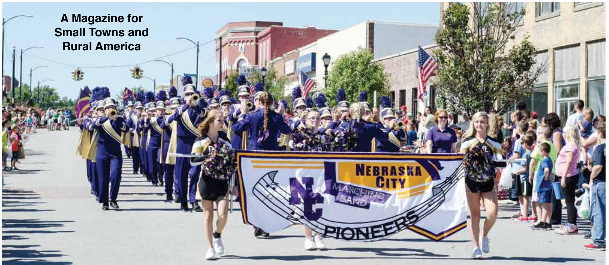
Pride of the Pioneers, Nebraska City's High School Marching Band -- AppleJack Festival, September 17, 2016

A Magazine for Small Towns and Rural America