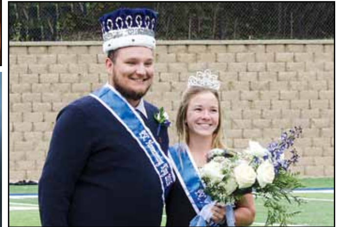
Homecoming King & Queen