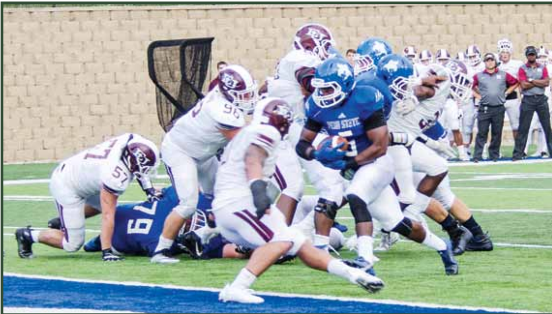
Short yardage run to goal. September 3, 2016, Oak Bowl