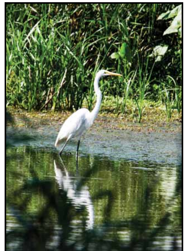
Migrating Egret Fishing at Wildlife Refuge