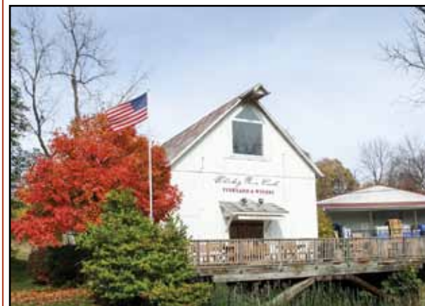
Whiskey Run Creek Winery