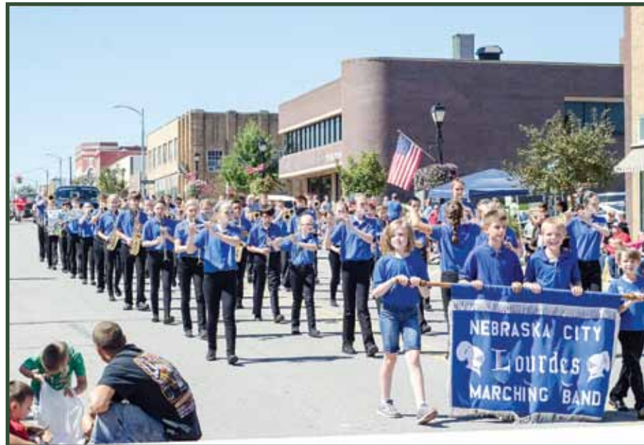
Nebraska City Lourdes Marching Band, AppleJack Parade