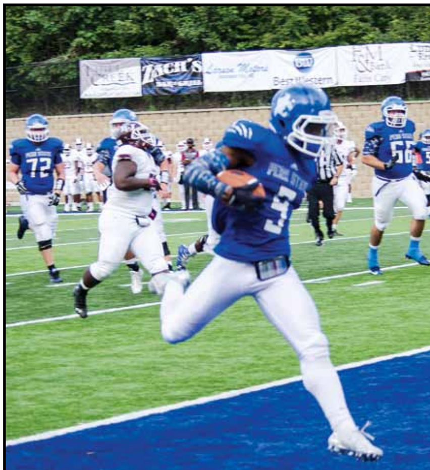
First 'at-home' Touchdown of the Season, September 3, 2016.