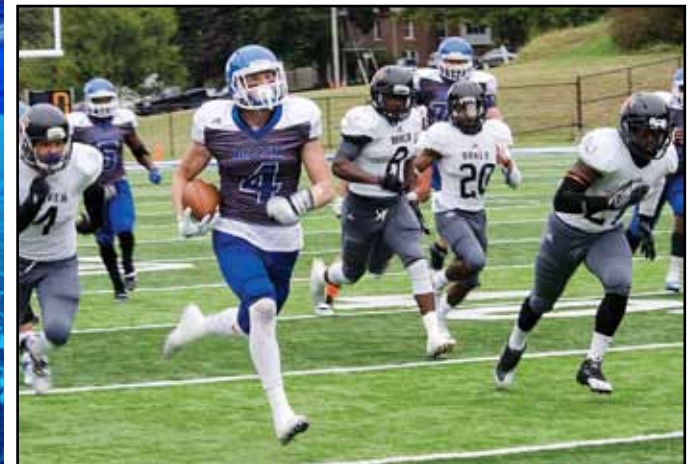
They Won't Catch Him!