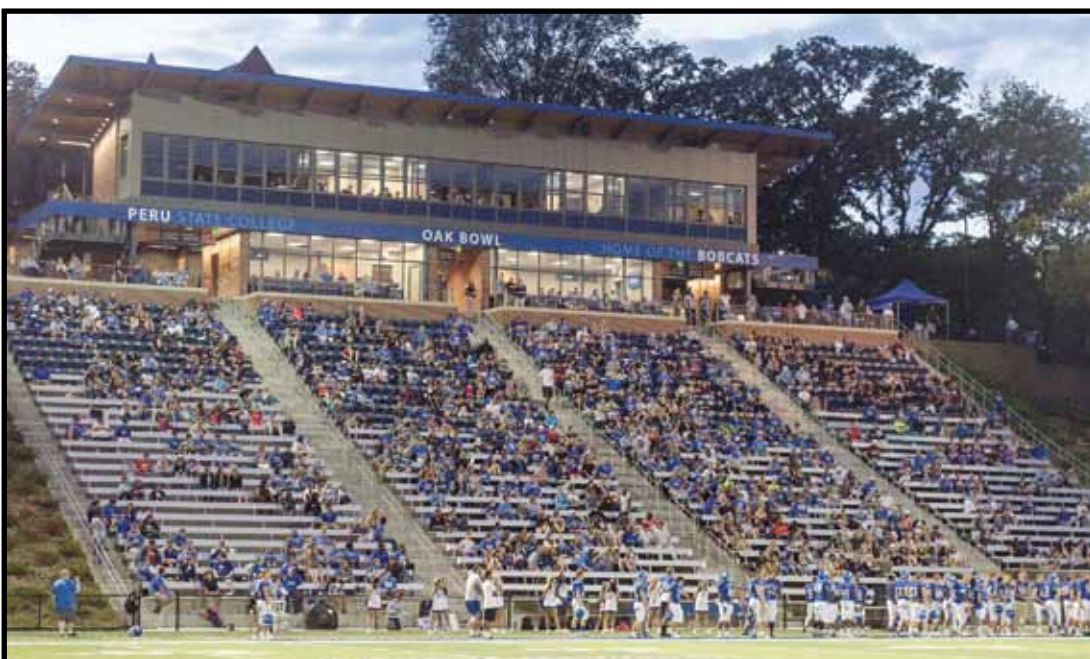
PSC Oak Bowl Stadium, First Home Game, September 3, 2016, at Night.