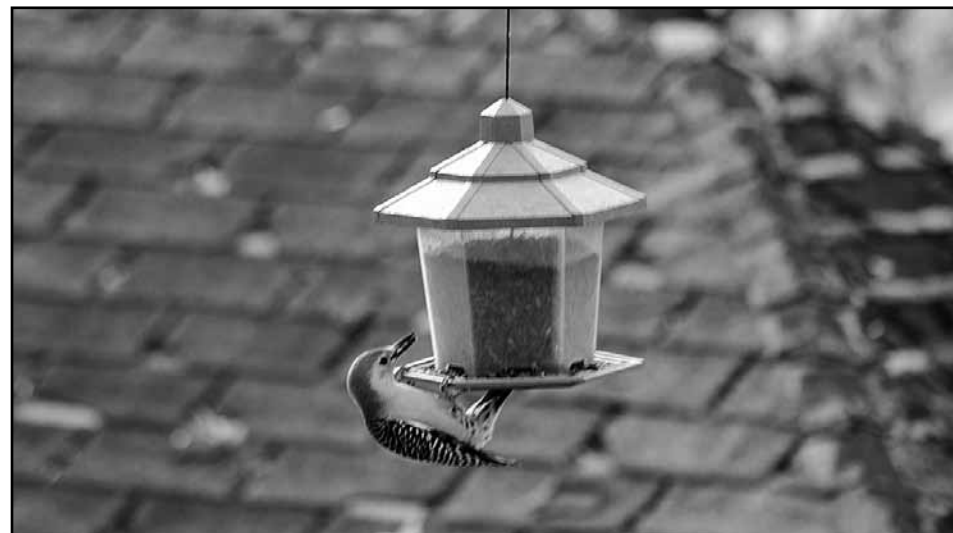
This woodpecker likes black oil sunflower seeds.