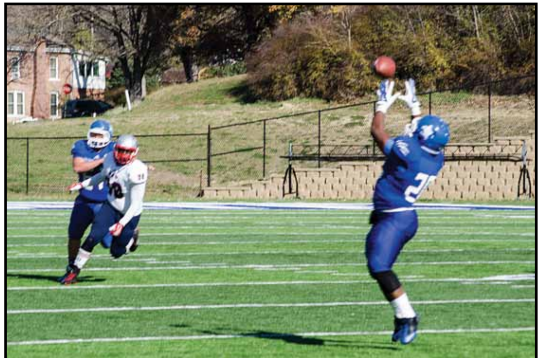
PSC Football; November 1, 2014

Open 8:00 AM - 5:30 PM Monday - Friday (402) 274-3614 2000 N Street Auburn, Nebraska