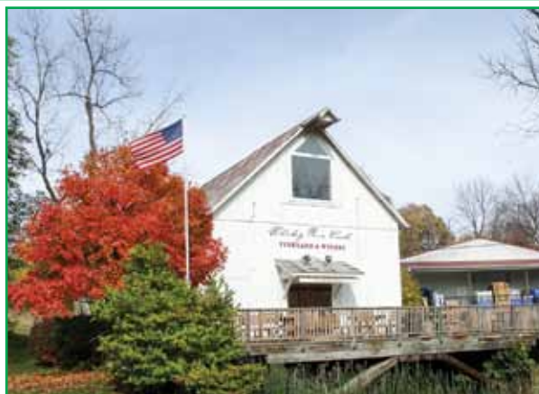
Whiskey Run Creek Winery