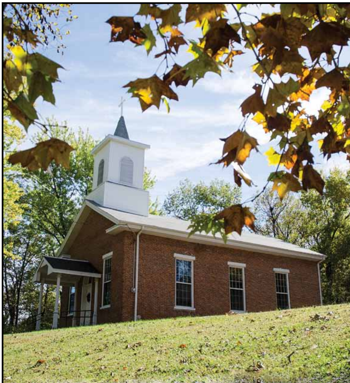
Another Church in the Hills of Southeast Nebraska