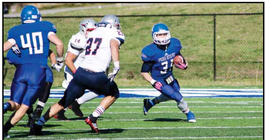
PSC Football; November 1, 2014