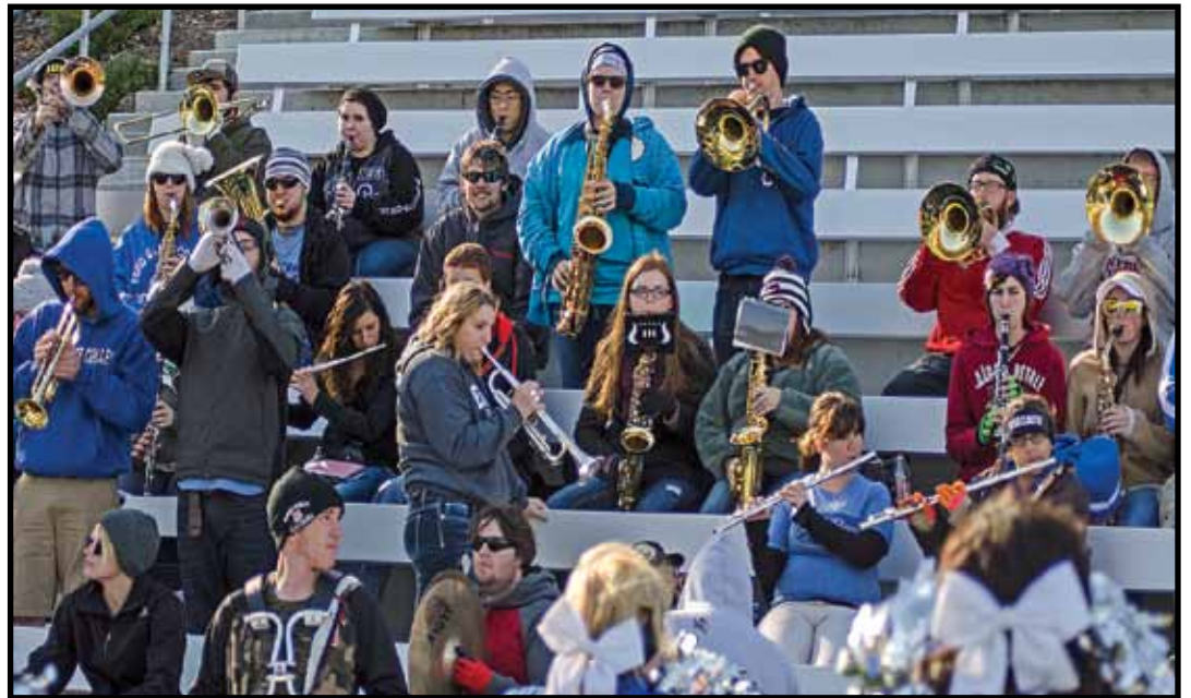
The Peru State College Band, November 1, 2014

Another favorite era I love to read about is King Arthur and Merlin, I must have over a dozen books about them written from every angle. Do you know that there are some people out there who don't know who King Arthur is? Now I am being a bit of a snob, but if I have piqued your interest, great! No matter what your favorite genre is, keep reading. If you have children, encourage them to read. If you're a geek like me, don't let others intimidate you. Remember most of the giants in the technology world are science fiction readers. Wear and read your geekdom with pride. For we are the geeks! Many of us live where life is good and our heroes, oddly, for the most part, have good old Midwestern values. (Oh if you want to know the difference between a geek and a nerd ask your smart phone.)