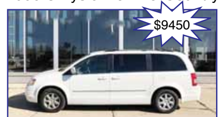
2010 Town & Country 3.8L V6