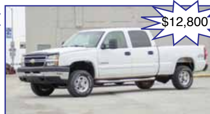
2006 Silverado 2500 HD 6.0L