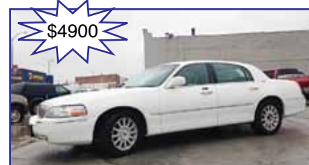
2007 Lincoln Signature Town Car