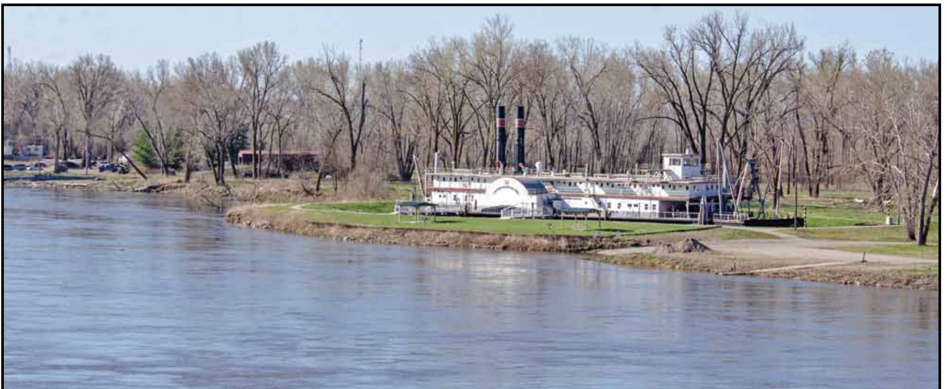
Captain Meriwether Lewis Missouri River Dredge Museum Open Weekends, Mid May through Mid October

Visit us in Auburn or Syracuse and check out our lineup of Deere equipment for all your harvesting requirements.