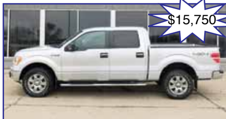
2012 Ford F150 XLT