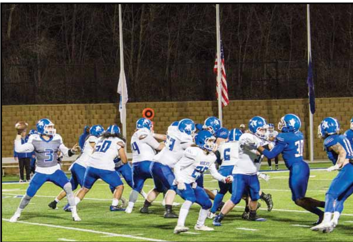
Peru State College 'Blue-White' Scrimmage Under the Lights, April 20, 2018. More PSC Sports on pages 13 & 14.