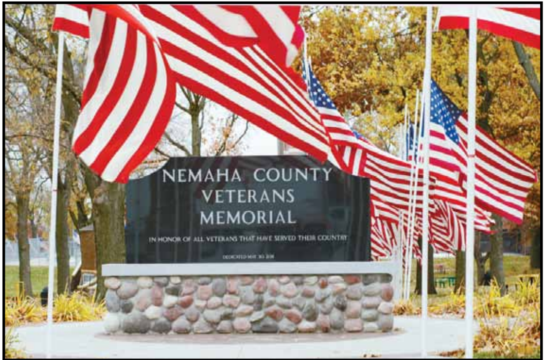
Nemaha County Veterans Memorial, Auburn, Nebraska

At home, my red rose stands silently in a simple vase and wilts.