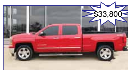
2014 Silverado 4x4 LTZ Z71