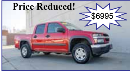
2006 Chev Colorado Z71 Crew Cab