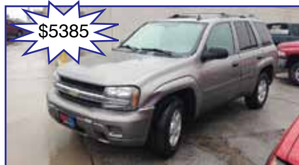
2006 Chevy Trail Blazer