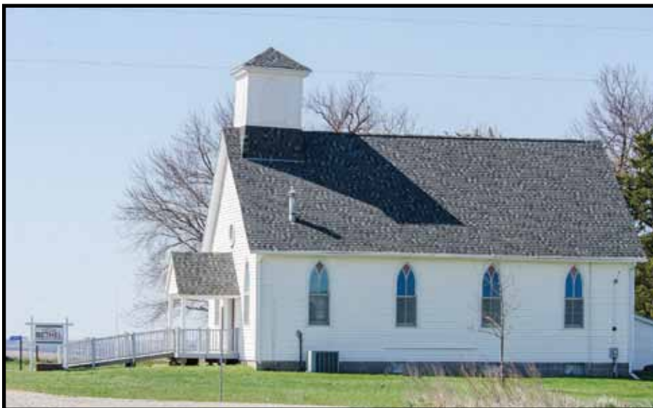
The Bethel Church at a country crossroads near Peru is as pretty a picture as it was almost 20 years ago.

I listened to all the lyrics of "Diamonds and Rust" a few weeks ago, and understood what the song was about for the first time. My memories are bitter-sweet (diamonds and rust), when I think of their relationship and what might have been... what I wished for them... but what had to be. I thought of other familiar 'great loves'; Anthony and Cleopatra, Bogart