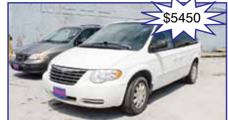
2006 Chrysler Town & Country