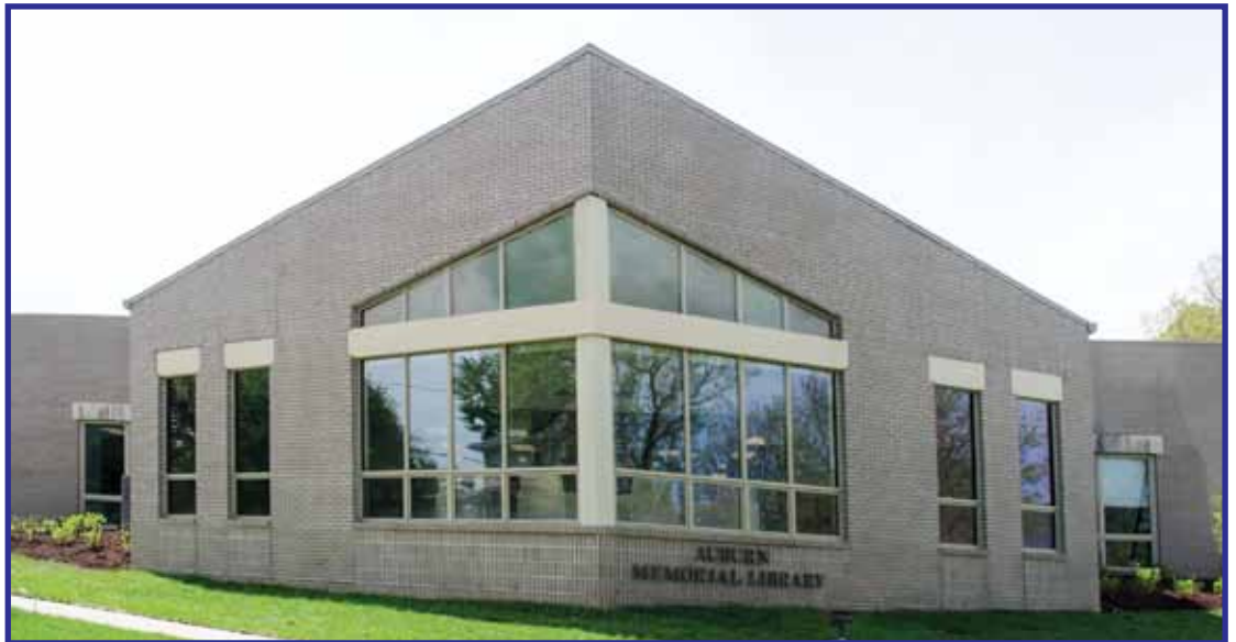
Auburn's library has a new look with the Dorothy Blount Memorial Addition .

Open 8:00 AM - 5:30 PM Monday - Friday (402) 274-3614 2000 N Street Auburn, Nebraska