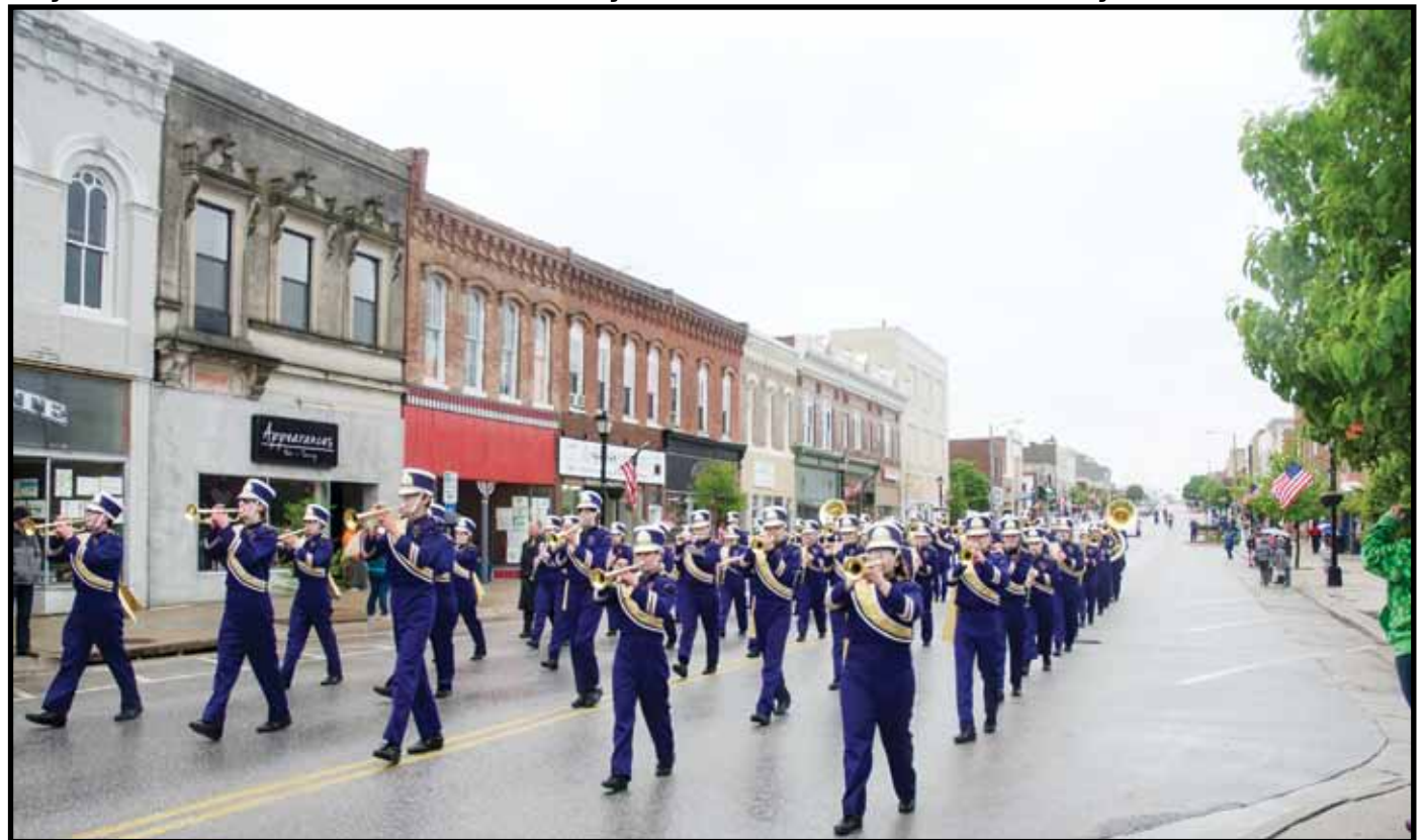
Nebraska City Pioneers Marching Band, Arbor Day Parade, April 29, 2017