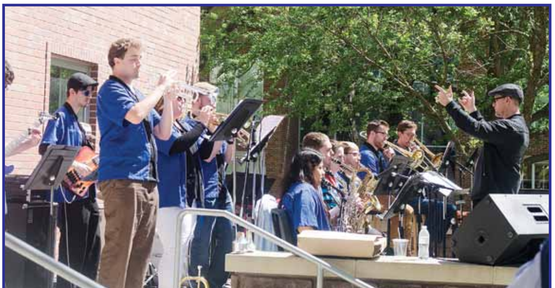
The PSC Jazz Band played on the 'Quad' on the last Thursday in April. It was a jazzy exit for the 2016-2017 academic year.