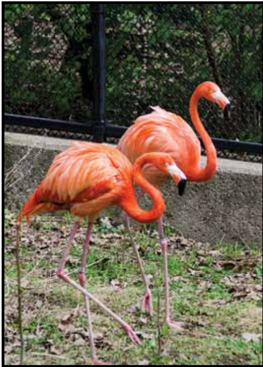
More Zoo Photos on Page 6

A Magazine for Small Towns and Rural America