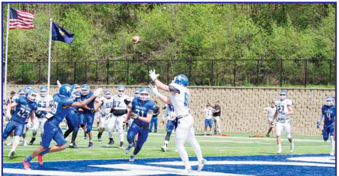
It was a beautiful day in April for the Blue / White Game.