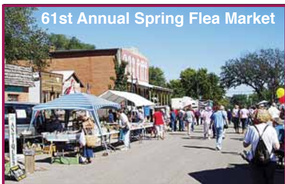
61st Annual Spring Flea Market

814 Central Ave. Auburn, Nebraska 68305 Call 402-274-2277 Visit www.TincherAutoSales.com