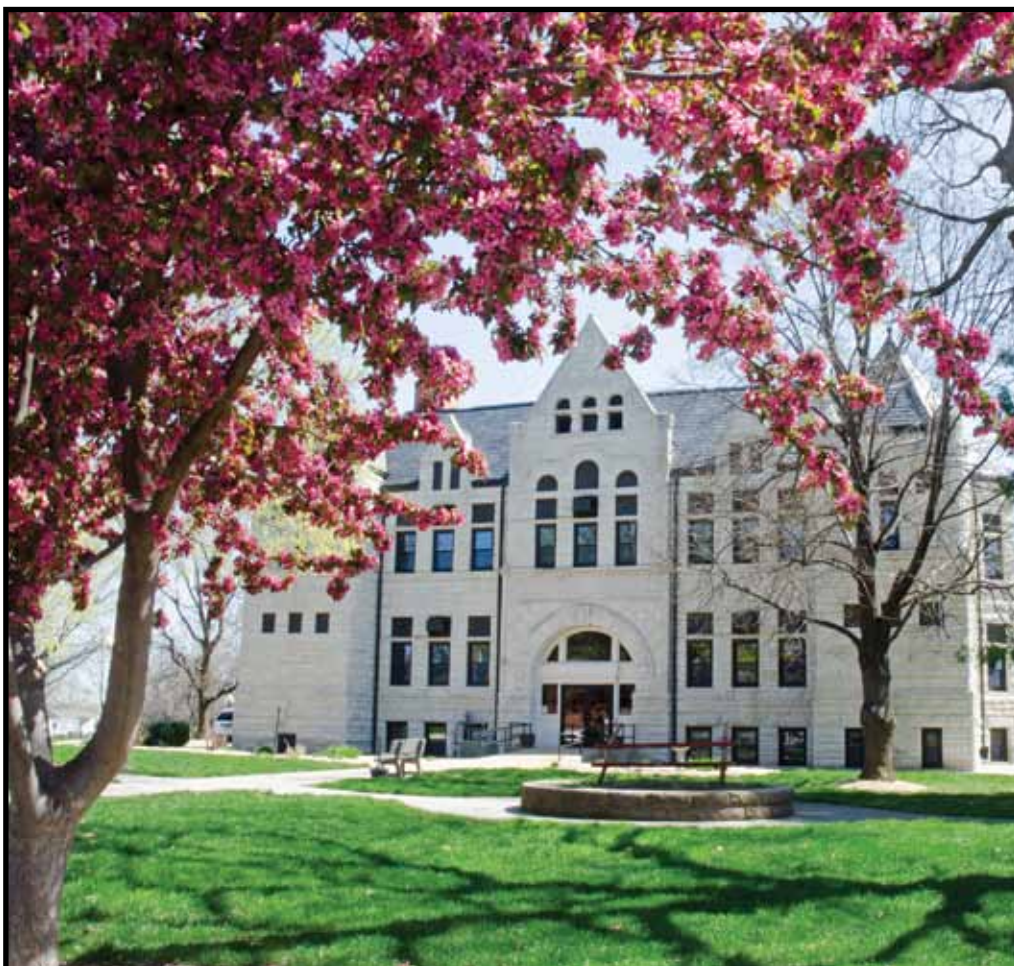
Nemaha County Courthouse in Auburn, Nebraska