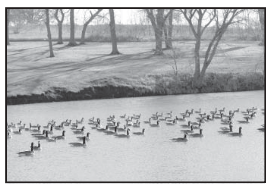
Canada Geese on the lake just south of Hiawatha.

"Honey Creek Vineyards Bakery, in Peru, is back in Business. Full service catering is now available. We are baking to order on Tuesdays and Fridays. A few of our specialties are Kolaches, Sprouted Wheat Bread, Rye, and Ethnic Breads. Pies are made from scratch. Call at least a day ahead for bakery or two weeks ahead for catering at 274-9057 or 872-4865. Pick up locations are available in Peru or Auburn."