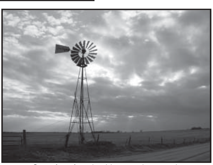
One of my favorite things to photograph, no matter what the weather.