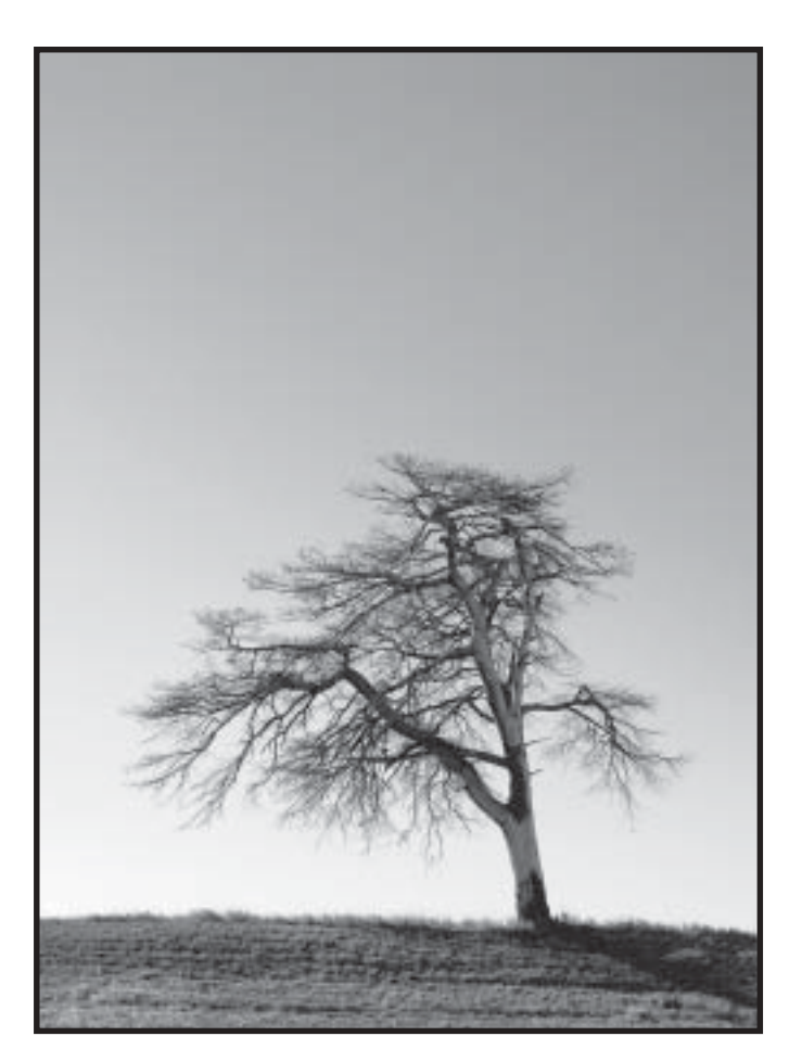
Waiting for Spring, here at sunset, on a crest shouldering the highway between Horton and Hiawatha.