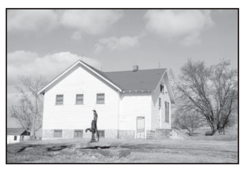
School on scenic H-275 just north of Rock Port.