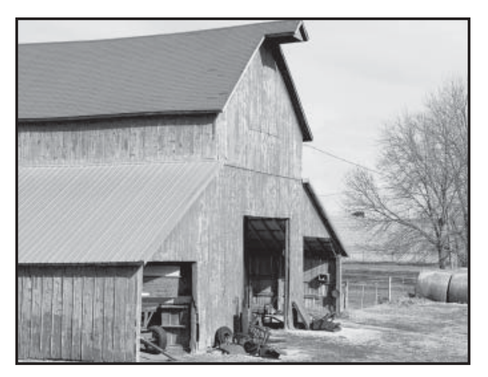
This barn displays some of its many functions.