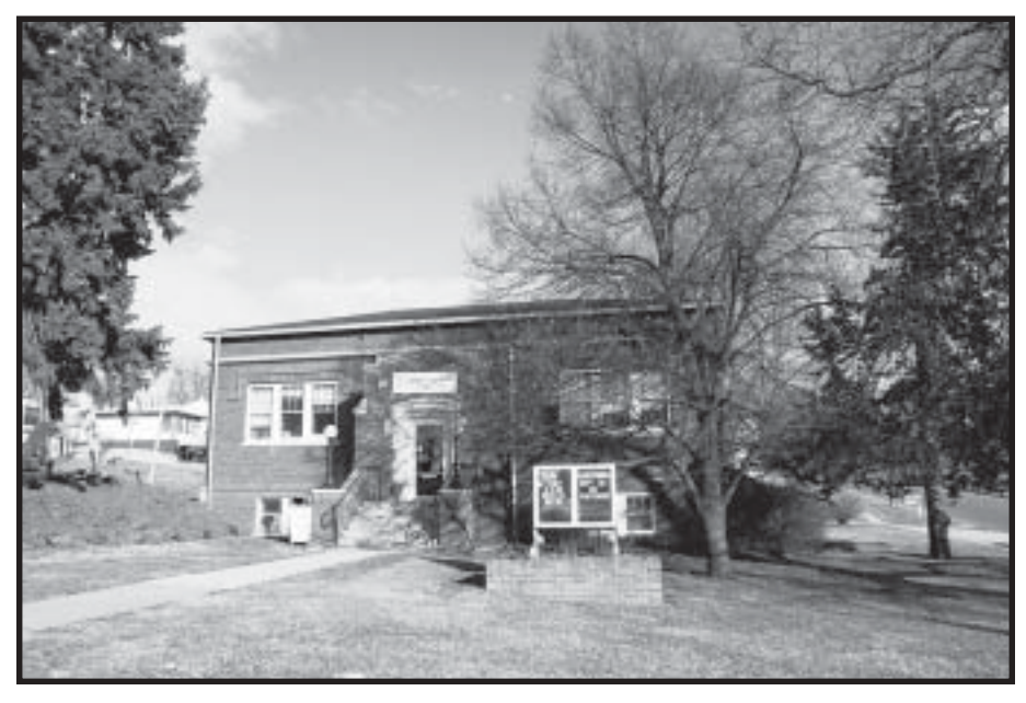
Malvern's library is growing.