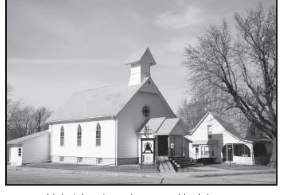
Little 'church on the corner' in Johnson.