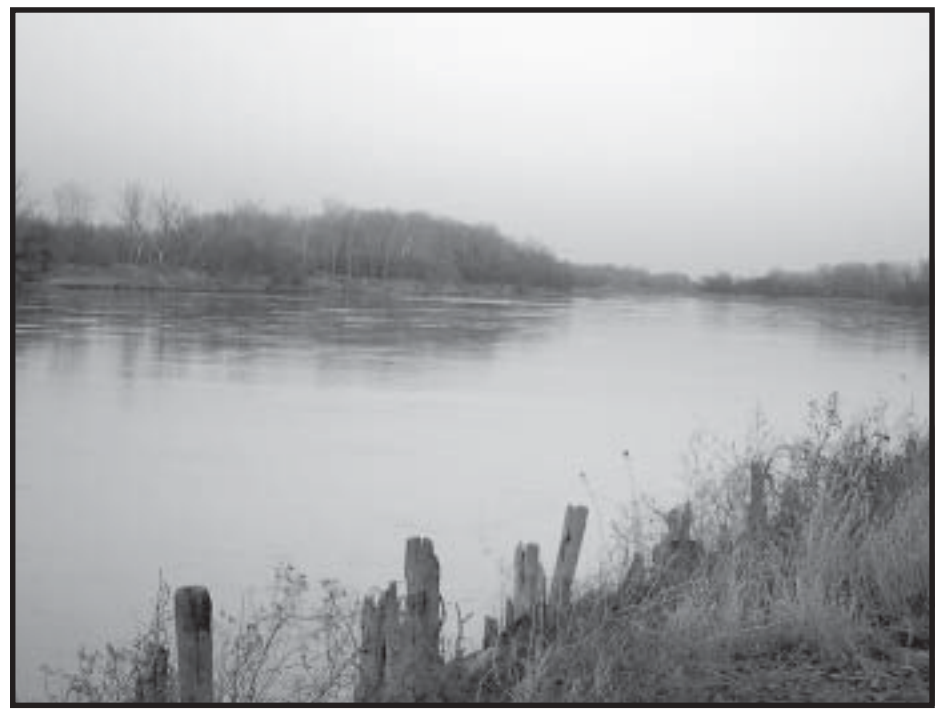
This month's river picture shows the river flow over the top of the rock dikes.