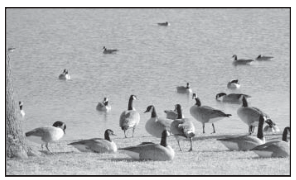
Canada Geese 'at the beach' near Hiawatha.