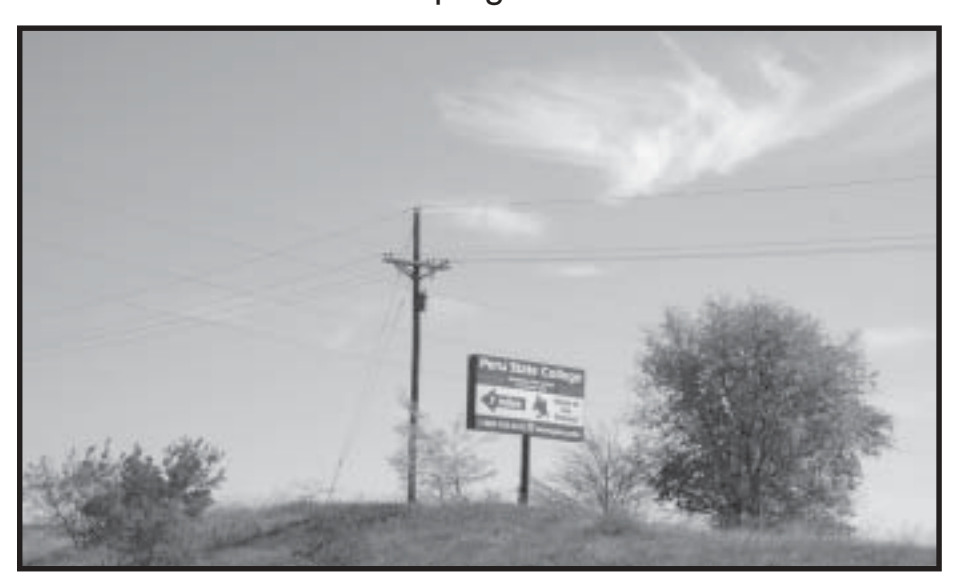
Southeast of Peru at the intersection of highways 67 and 136.