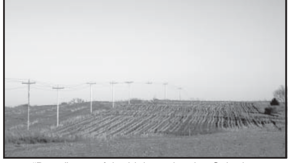
"Rows" east of the highway leaving Sabetha.