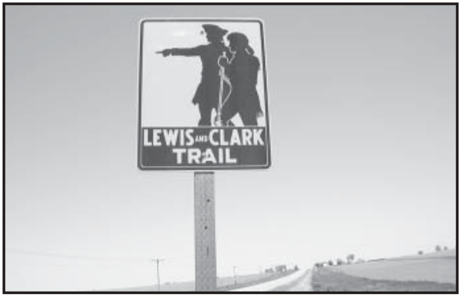
H-67 southeast of Peru.