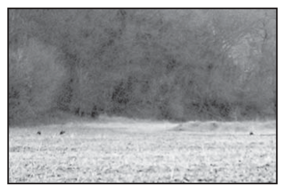
This month's hunting picture is turkeys foraging for food near the edge of the timber.