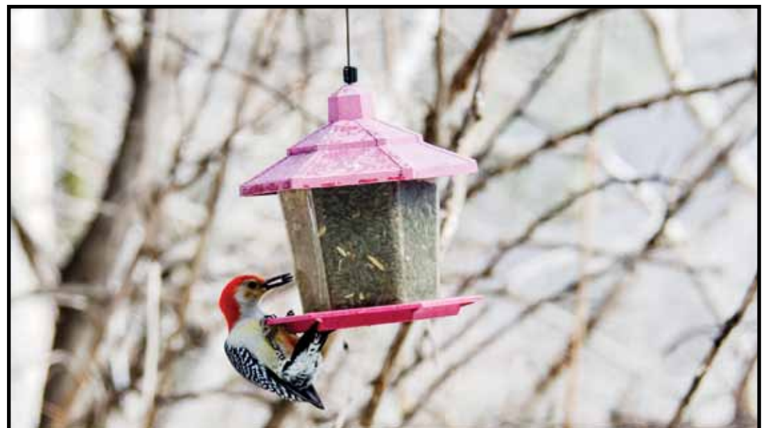
The Red-bellied Woodpecker is entertaining to watch.