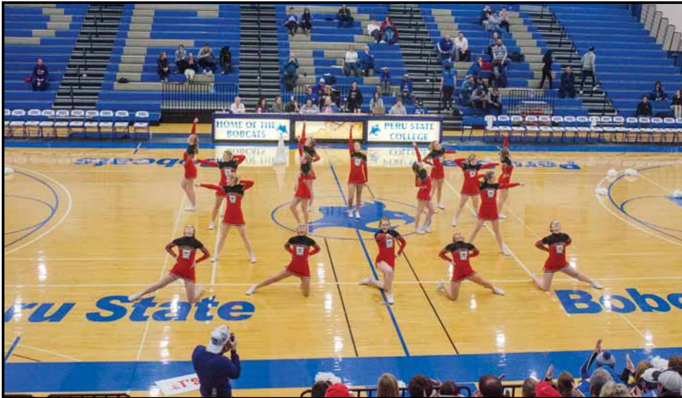
Auburn Cheerleaders performed at the halftime of Peru State College Basketball... See Page 6

A Magazine for Small Towns and Rural America