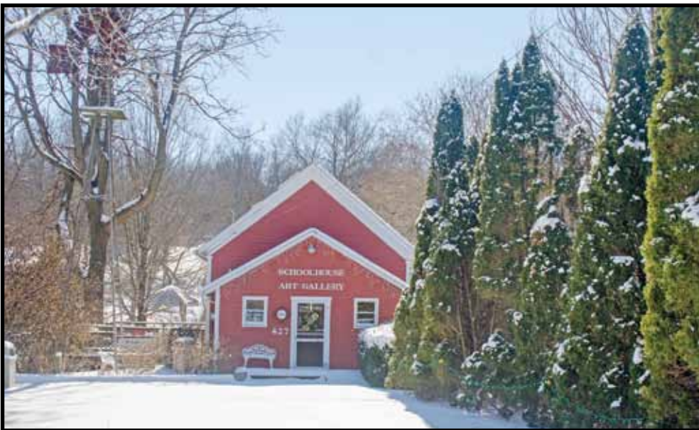
The Brownville Fine Arts Gallery, February 2018