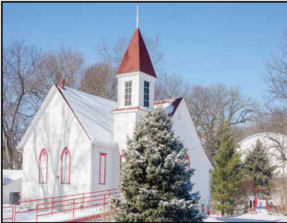
The Brownville Village Theatre, February 2018