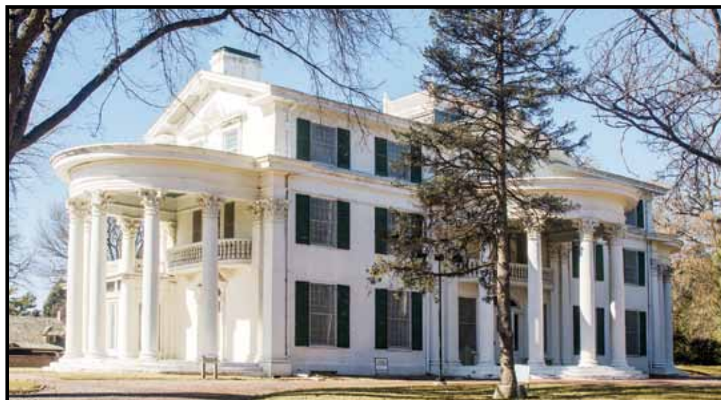
Arbor Lodge, Majestic Even Between Seasons