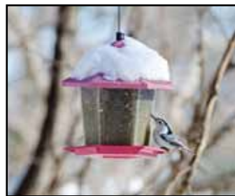
More 'Birds in Winter' on page 4