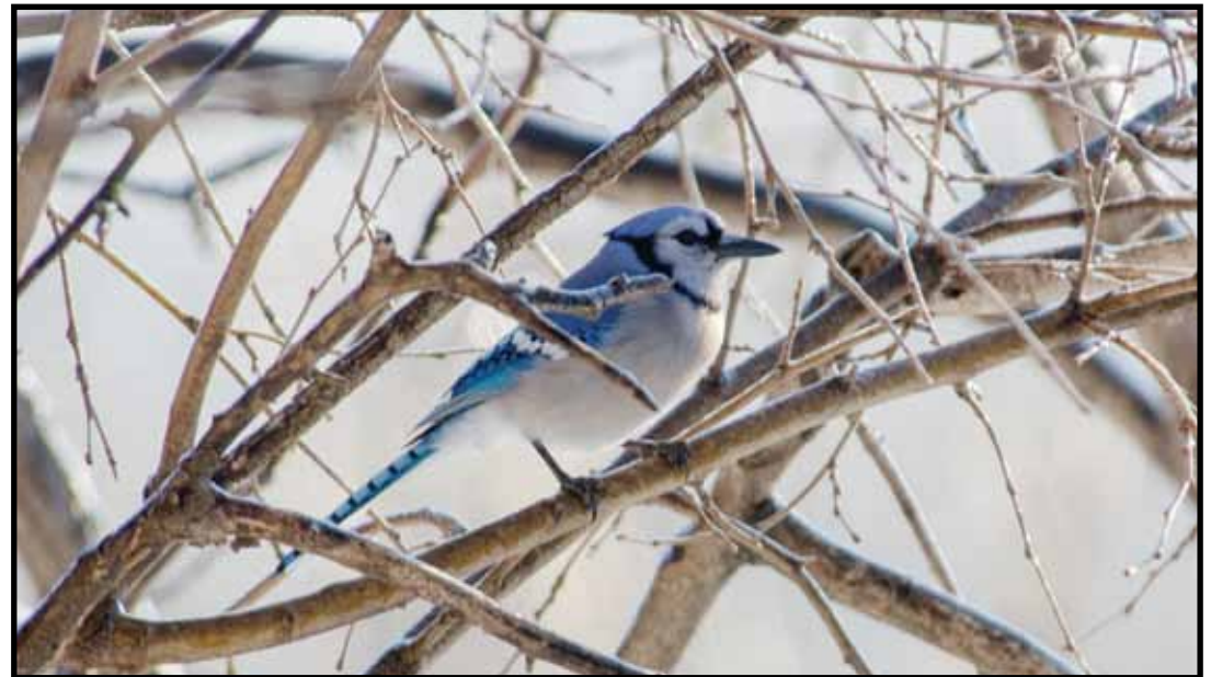
The Bluejay is too big for the feeder; he finds spilled seeds underneath.