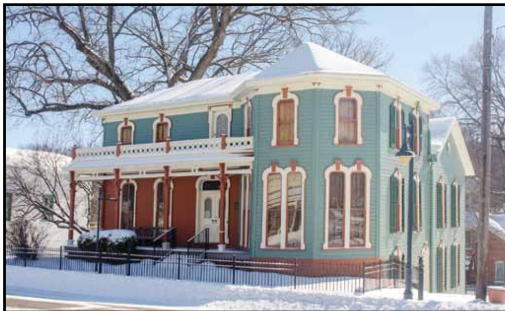
Brownville's Carson House, February 2018