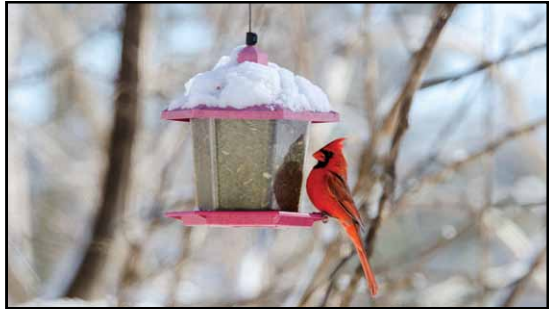
I tried to keep my feeder full during the cold and snow.