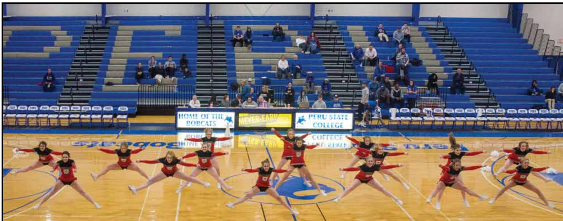
Auburn Cheerleaders performed at the halftime of Peru State College Basketball

Stutheit Implement has Toro and Honda Snow Blowers.