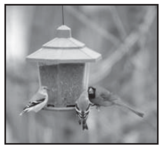
Cardinal Warning Goldfinch