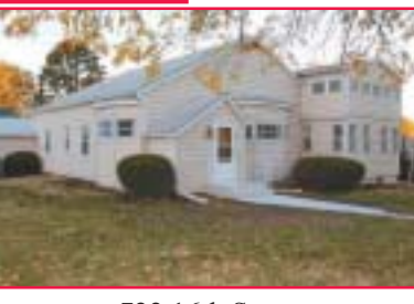
722 16th Street 4-bed, 2 bath, basement, 3-car garage, fire-place, covered patio.