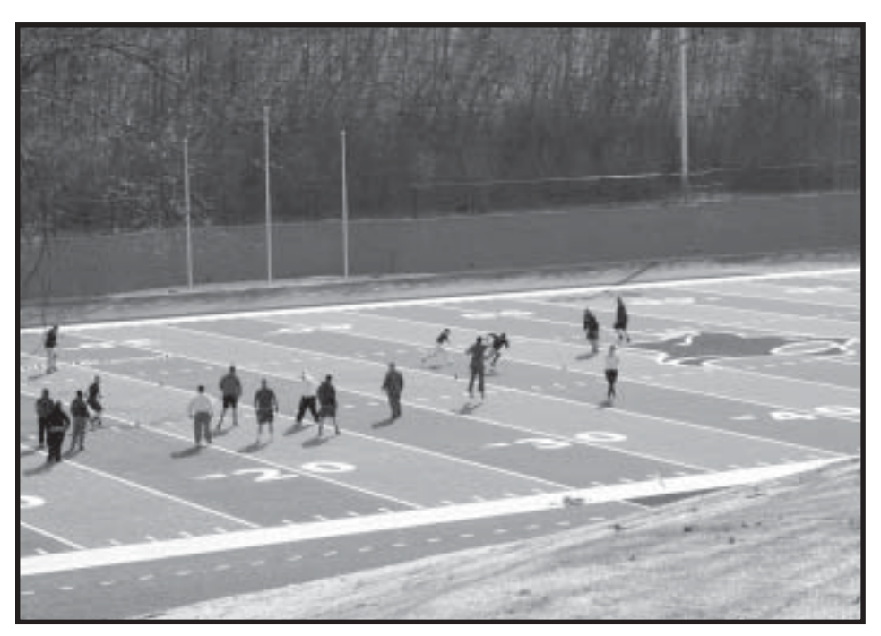
PSC Spring (30 degrees!) 'Trials'?

work horse of all gardens; the vegetable garden or portage? You want romance, you turn to the French "Le Délicieux Jardin", oh oui, oui (yes, yes) sounds very sexy to me. One major room is left to be named, the garden pond and island. At last, I have run out of creativity, as well as space in my article (stayed tuned). Oh and be assured there will be creative signage. Keeping my garden rooms functional certainly helps give me a reason to get up in the morning, where life is good.