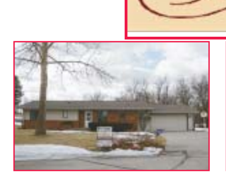
701 Brookridge Terrace 3-bed, 3-bath, basemt, stainless steel applances, new deck w/roof.