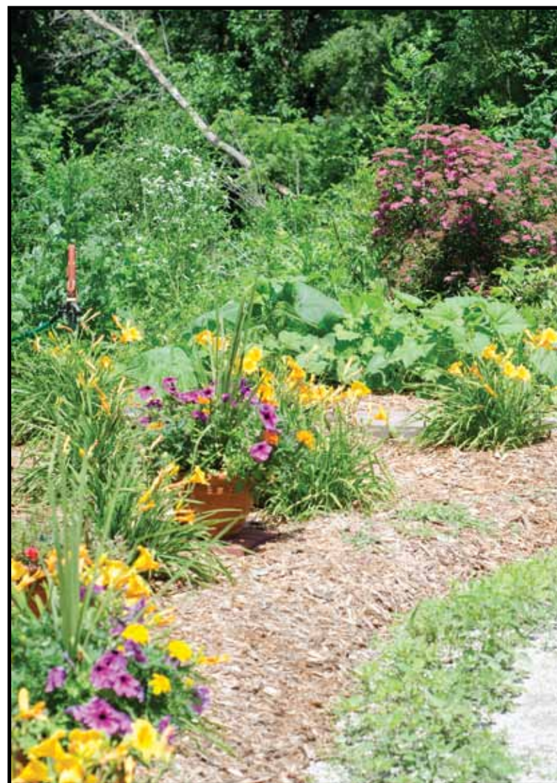
Part of one of the gardens at Whiskey Run Creek Vineyard & Winery