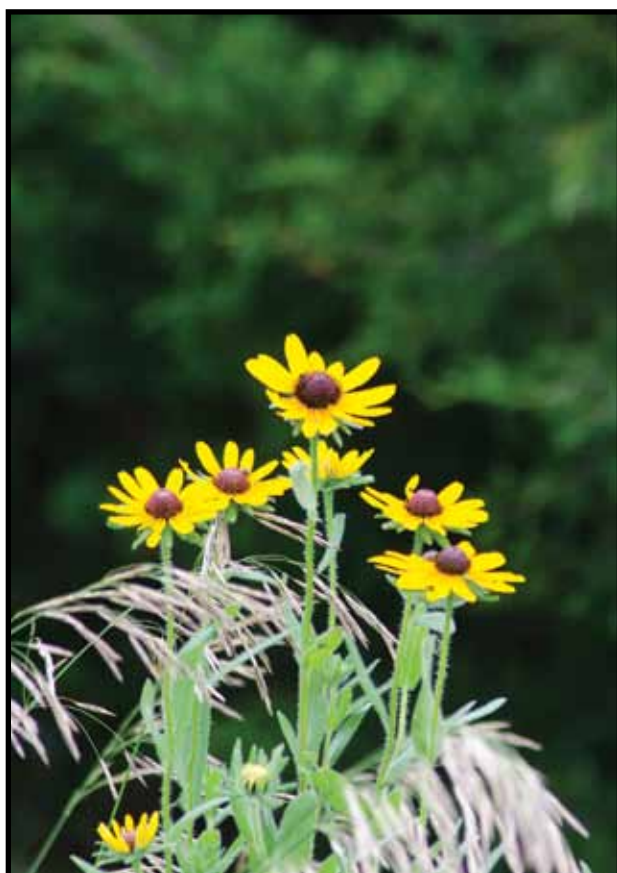
Wildflower along back road west of Brownville.

814 Central Ave. Auburn, Nebraska 68305 Call 402-274-2277 Visit www.TincherAutoSales.com