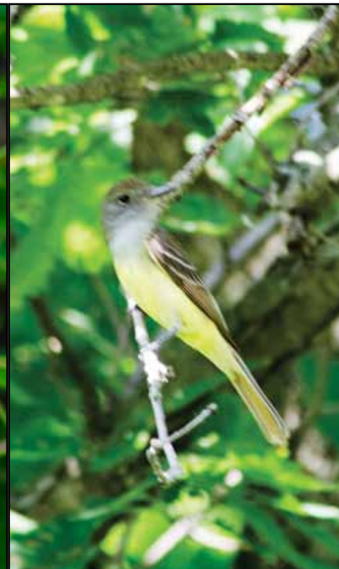
Photos Taken Along The Steamboat Trace on the First Day of Summer, 2015