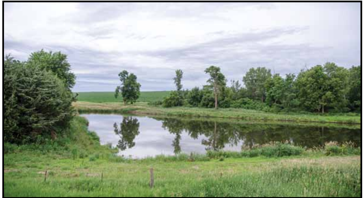
Farm Pond West of Peru, Nebraska