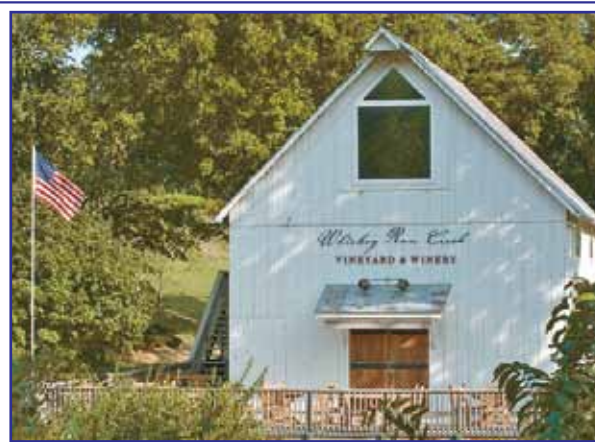
Whiskey Run Creek Winery