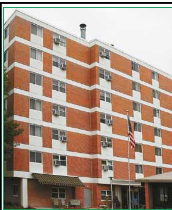
Valley View Apartments (High Rise) • 1017 H Street • Auburn, NE