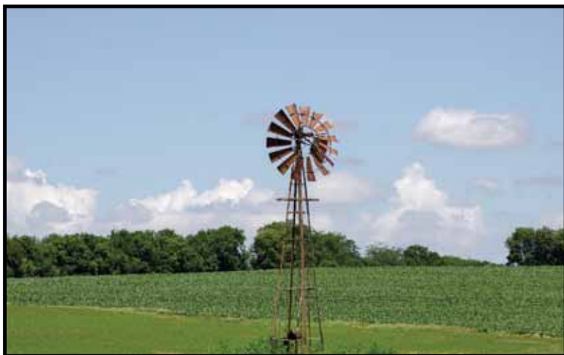
Some antiques preserve better than others.