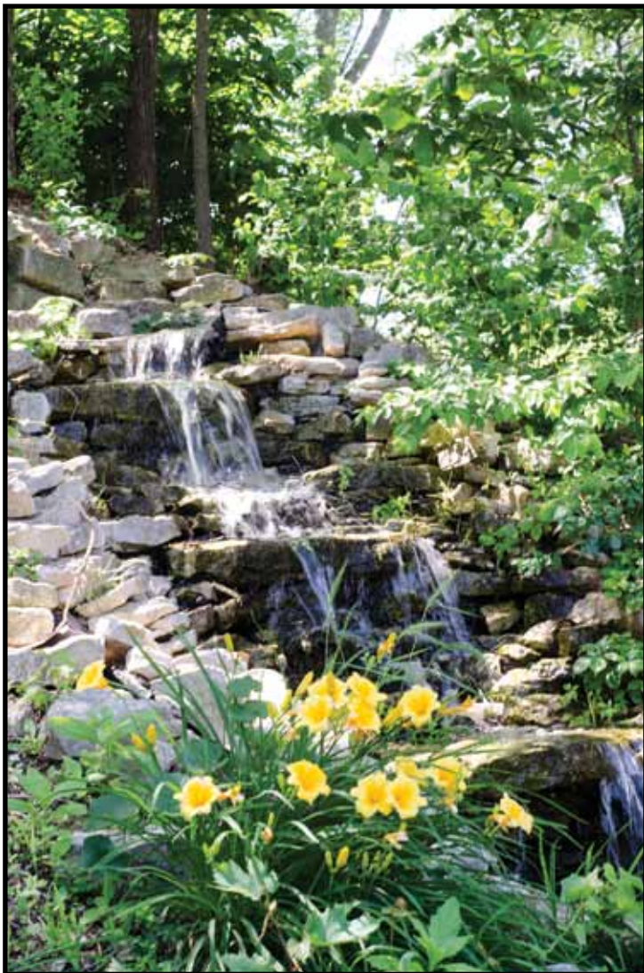
Charming waterfall in one of the gardens at Whiskey Run Creek Vineyard & Winery