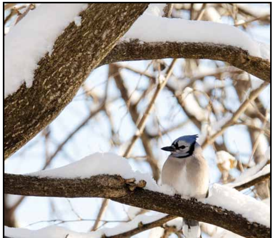
The Blue Jay only visits me to get black oil sunflower seed.