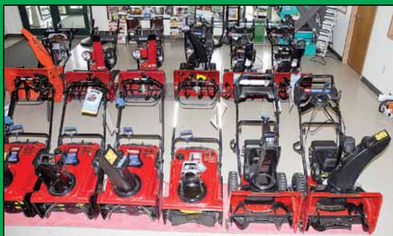
Stutheit Implement has Toro and Honda Snow Blowers.

See more new and used equipment at www.stutheitimpl.com