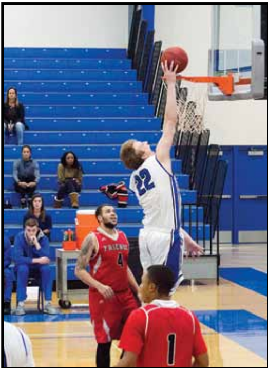
Peru State College win over Friends University 85-74, December 15

A Magazine for Small Towns and Rural America