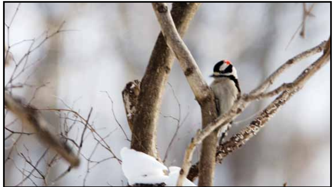
The Downy Woodpecker can be elusive.