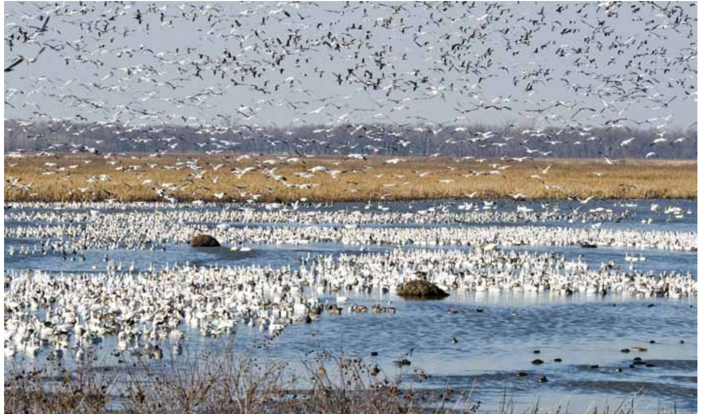
The Snow Geese are back! Loess Bluffs National Wildlife Refuge, December 4, 2017