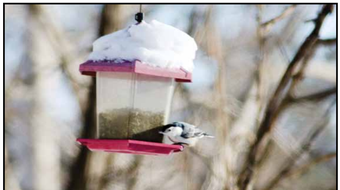
The Nuthatch grabs a seed and leaves almost as quickly as the Chickadee.