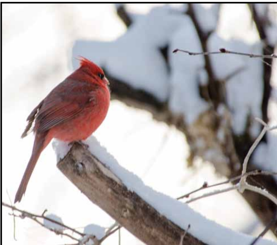
A Cardinal family nested in my yard last Summer.