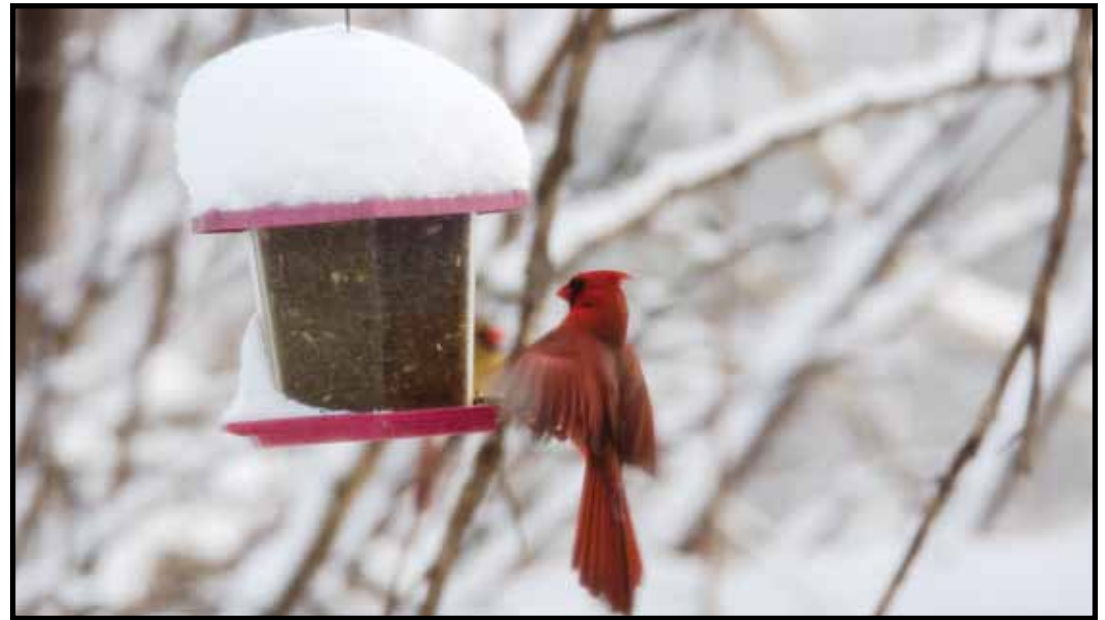
The Cardinal's red plumage is especially vivid in the Winter months.