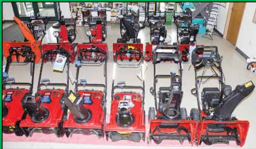
Visit us in Auburn or Syracuse and Check out our selection of Snow Blowers.