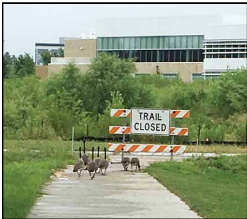
This shutdown appears to be for the birds.

At day's end they commute home pass my way again heading north routine predictable could set my watch by them pause to listen, watch it's pleasant living under a flight path.