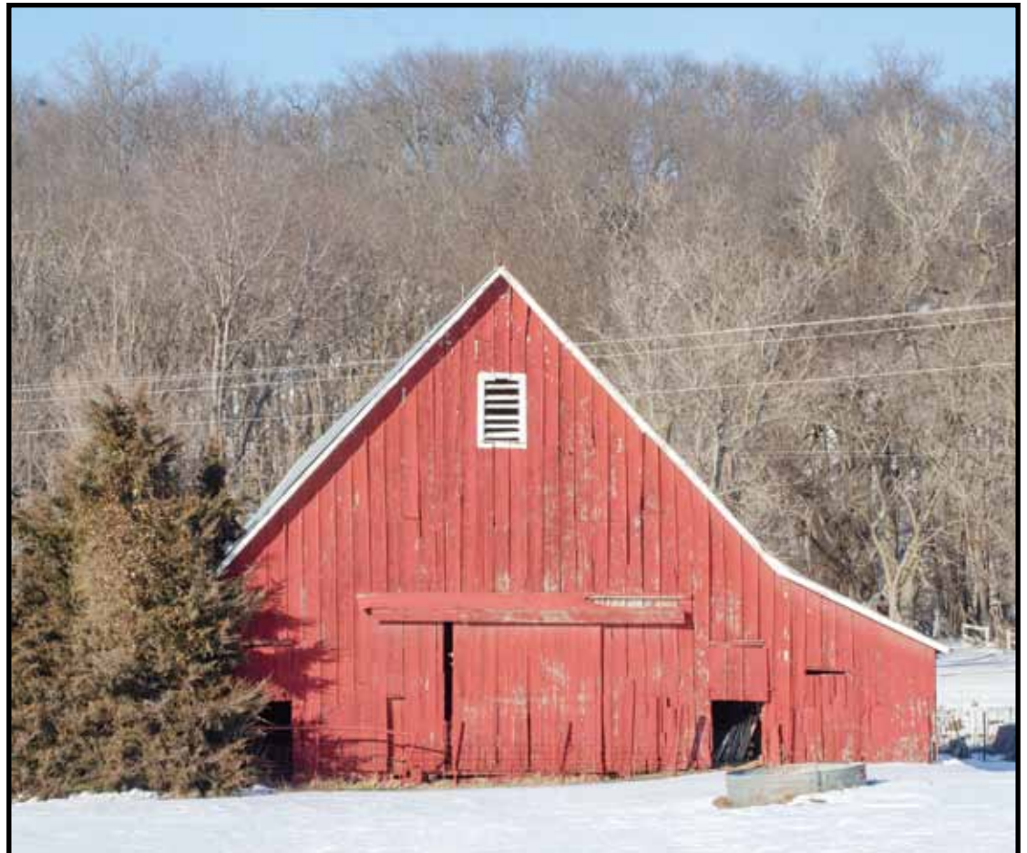
Another colorful barn is just off an I-29 exit south of Rock Port, Missouri.

Wilbur Miller & Sons 64637 731 Road, Brownville, NE Call: 608-487-5877 Email: wynmillgds@gmail.com