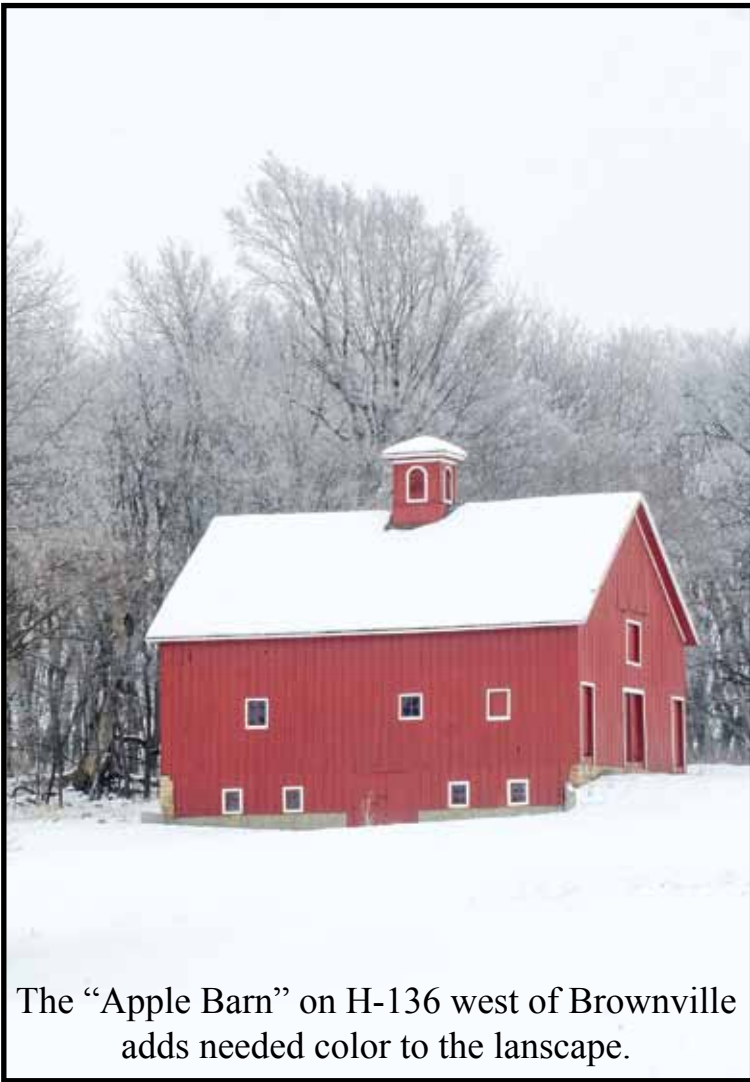
The "Apple Barn" on H-136 west of Brownville adds needed color to the lanscape.