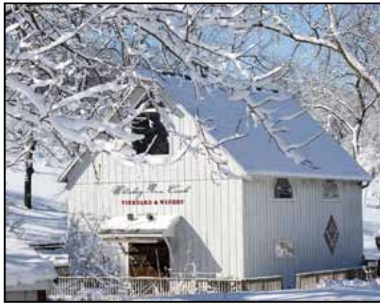
Whiskey Run Creek Winery