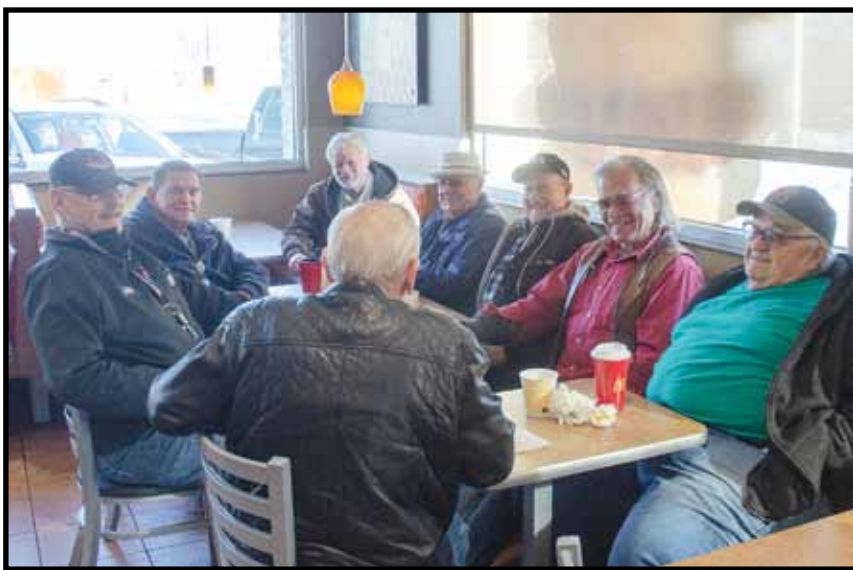
Coffee, friends, and conversation; warmer than the weather.

Making choices is part of moving forward with life. The results of our lives are due to the choices we make... and don’t make. Remember that it’s easier to live with failure than to look back and regret never having tried. Now, if I only could change Winter into Spring!