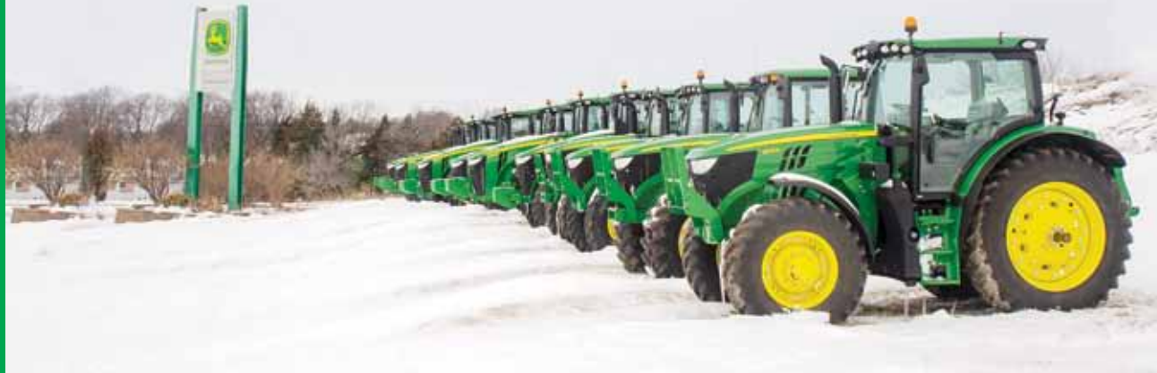
Visit us in Auburn or Syracuse, to see our lineup of John Deere Tractors.

Large Enough To Accommodate You, Small Enough To Appreciate You.