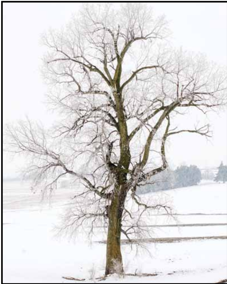
Cottonwood Tree along H-67, January 17, 2019