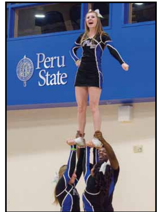
Peru State Basketball Photos Women's on page 4, Men's on page 9