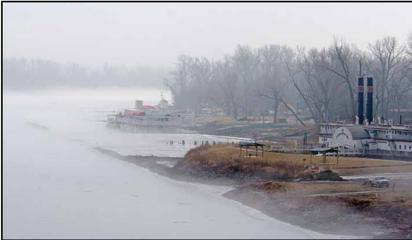
Foggy misty morning on the Missouri. The Captain Meriwether Lewis is to the right.

Auburn • Brownville • Cook • Falls City • Hiawatha • Johnson • Nebraska City • Peru • Rock Port • Sabetha • Syracuse • Tecumseh A Magazine for Small Towns and Rural America