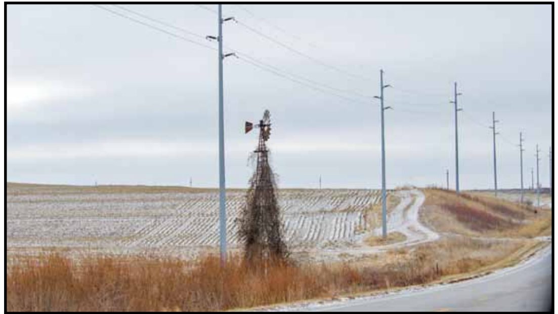
My 'favorite' windmill presents a classic image in every season.