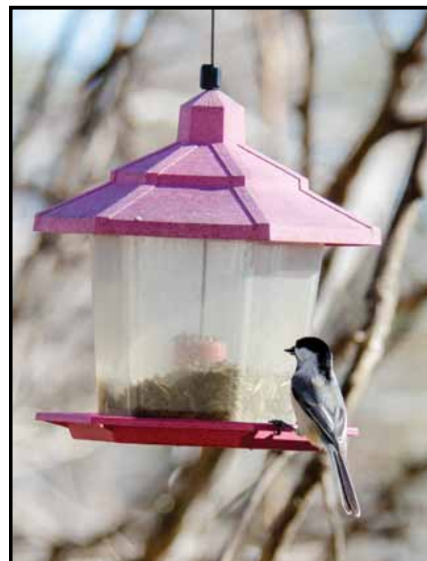
6 February 2018 Your Country Neighbor Left to right; Red-bellied Woodpecker, Titmouse, Lady Cardinal, Chickadee.