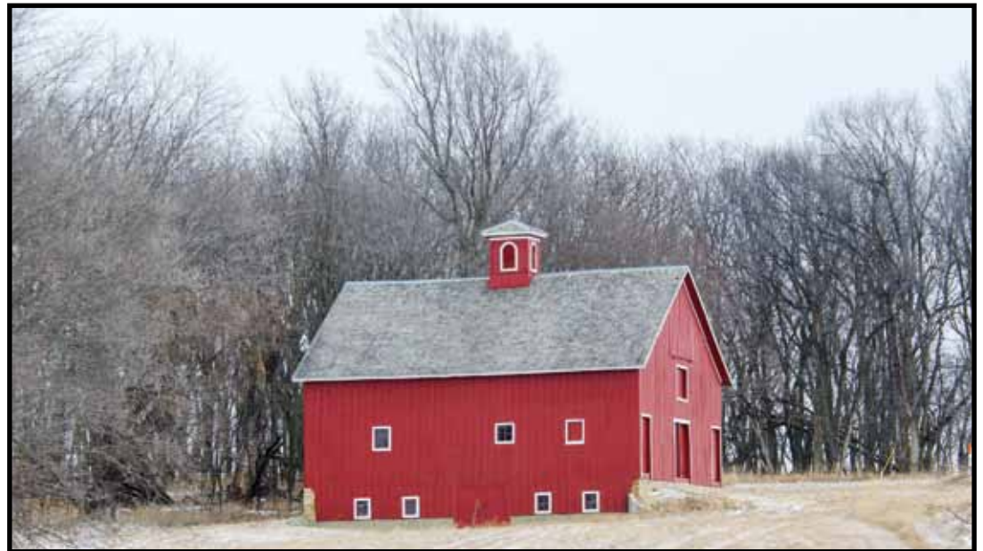
The "Apple Barn" adds color to the Winter landscape.