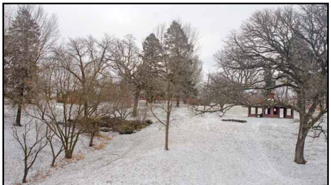
Soon Spring in Neal Park will display a Dogwood tree and "red buds".