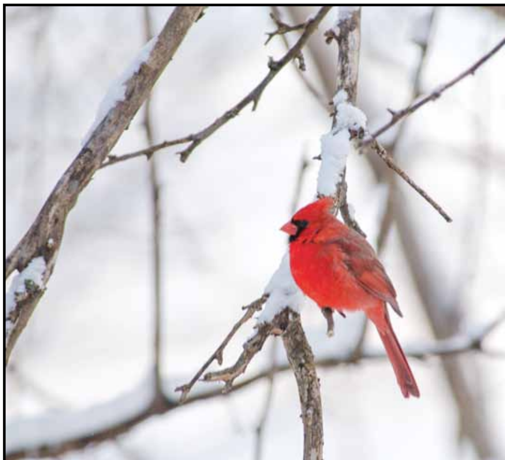
I think of the Cardinal as Nature's Valentine