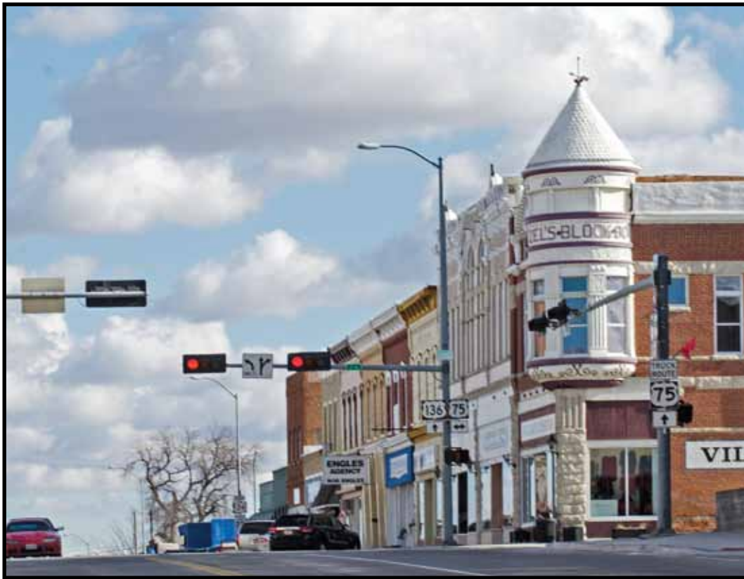
Historic Intersection; Auburn, Nebraska