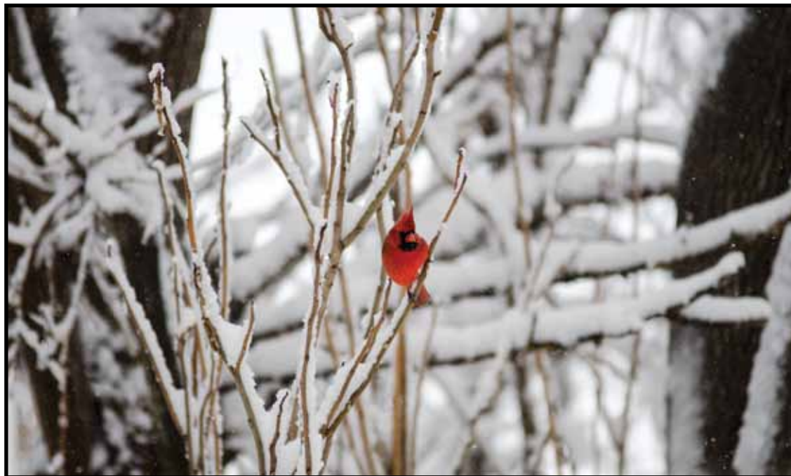
These Cardinal photos were taken after the first substantial snow of the season. Near my backyard bird feeder. Feb 1, 2015.