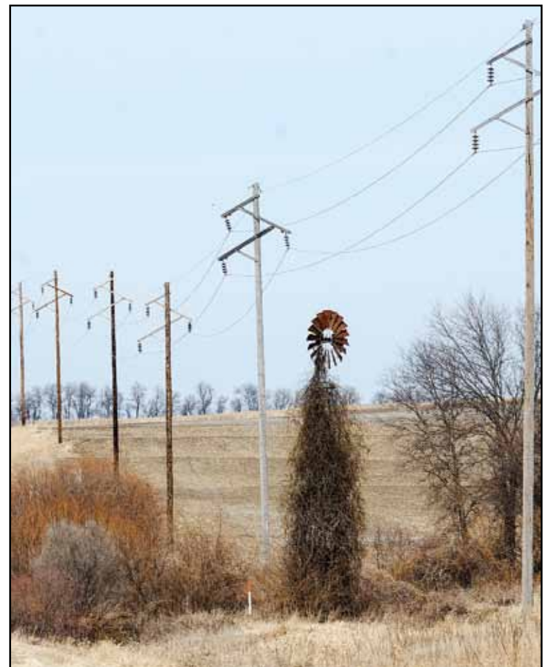
An Icon on Highway 67 in its Unglorious Winter Gown.