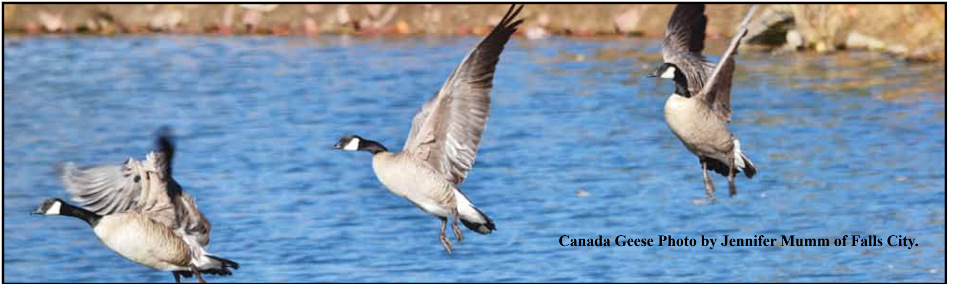
Canada Geese