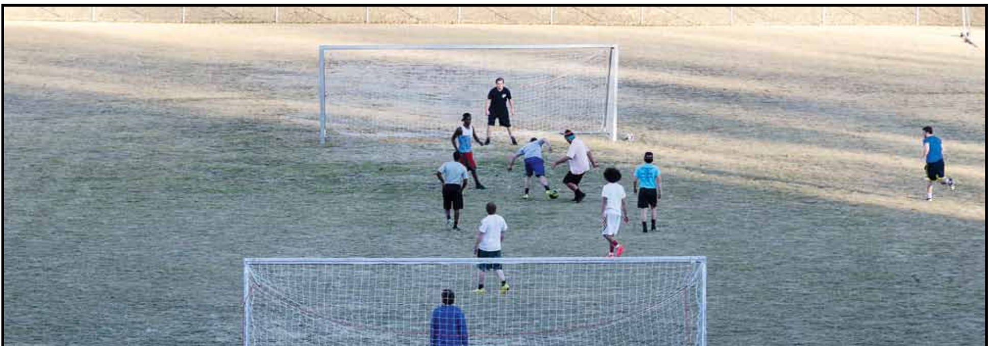
Near the end of January on the PSC practice field, these soccer players took advantage of the 60+ degrees weather.

John Deere - Honda - Toro Mowers in Inventory www.stutheitimpl.com