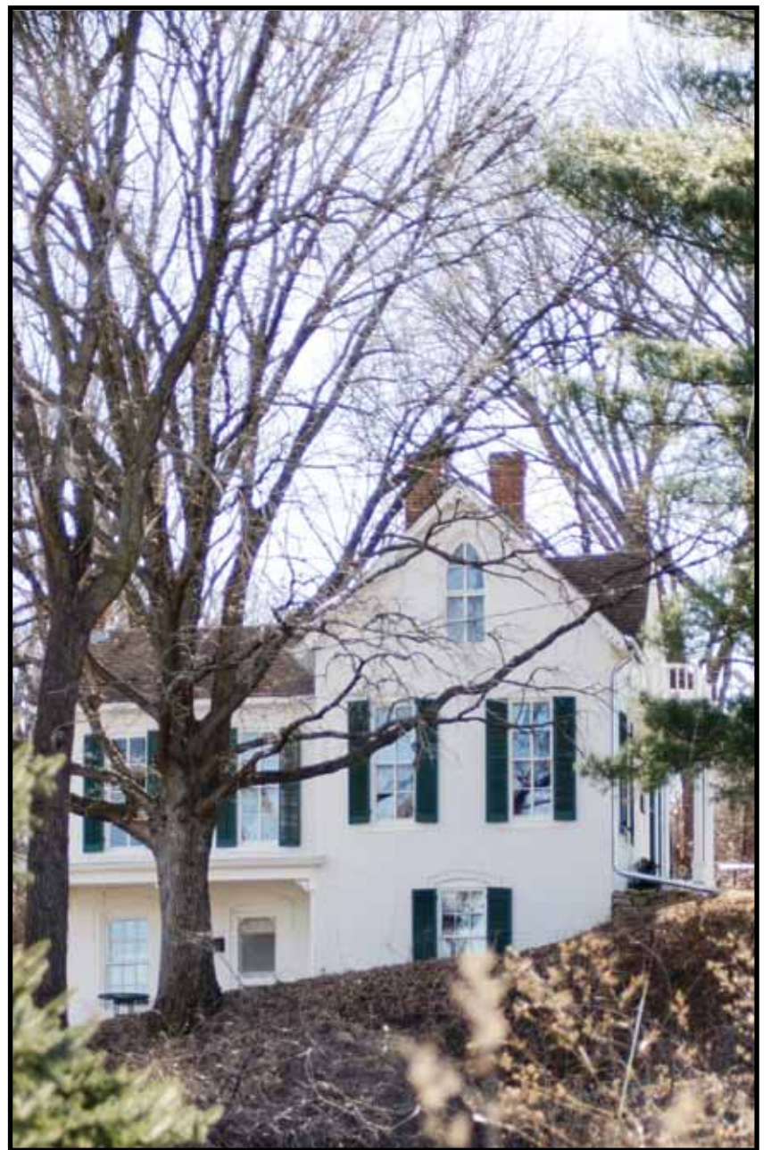
Governor Furnas Museum; Brownville, Nebraska