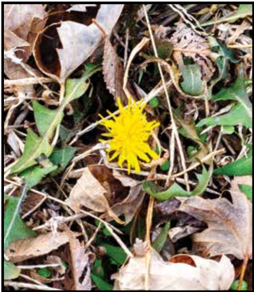
Left; Red-headed Woodpecker Right; Hardy Dandelion Both photographed along the Steamboat Trace on November 23.