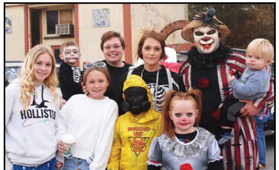
Halloween isn't just for the children.