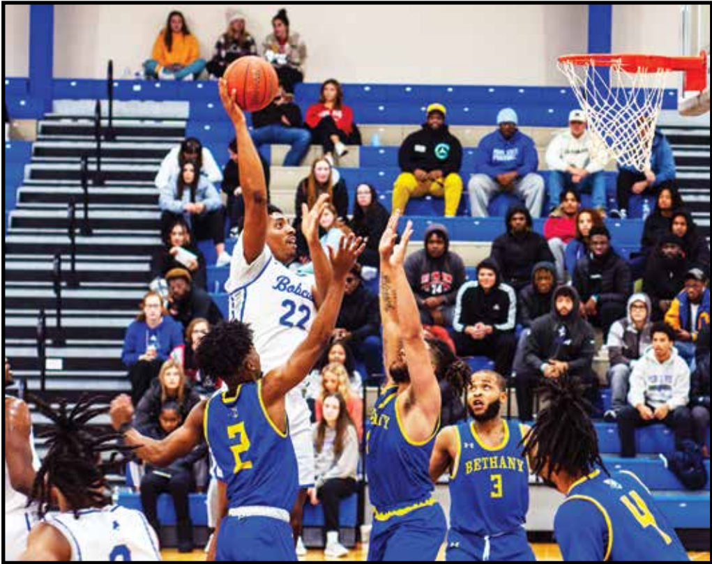
Men’s and Women’s Basketball Seasons are in full swing.