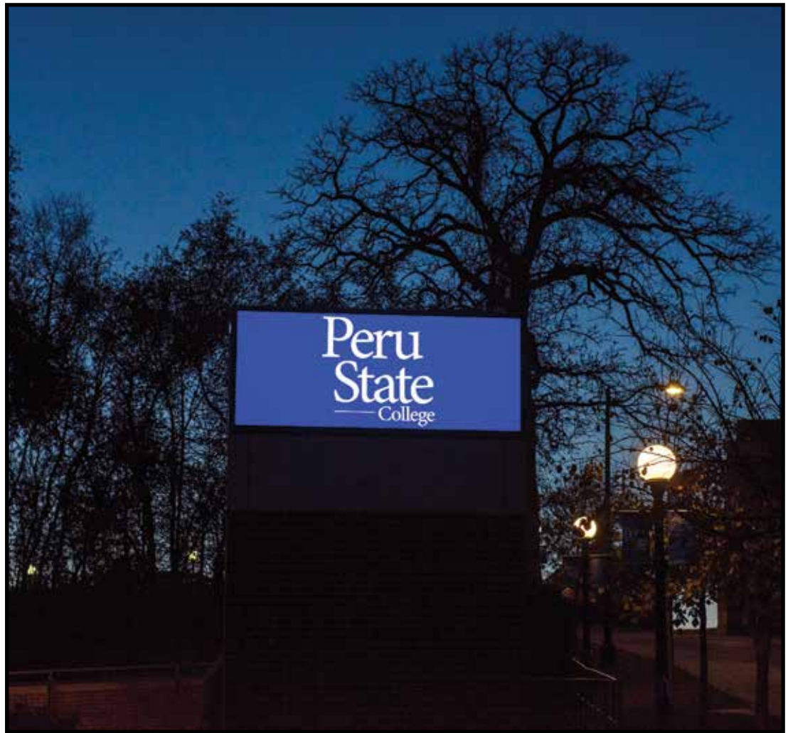
Approaching the Activity Center for an evening basketball game, or two.

Open 8:00 AM - 5:30 PM Monday - Friday (402) 274-3614 2000 N Street Auburn, Nebraska