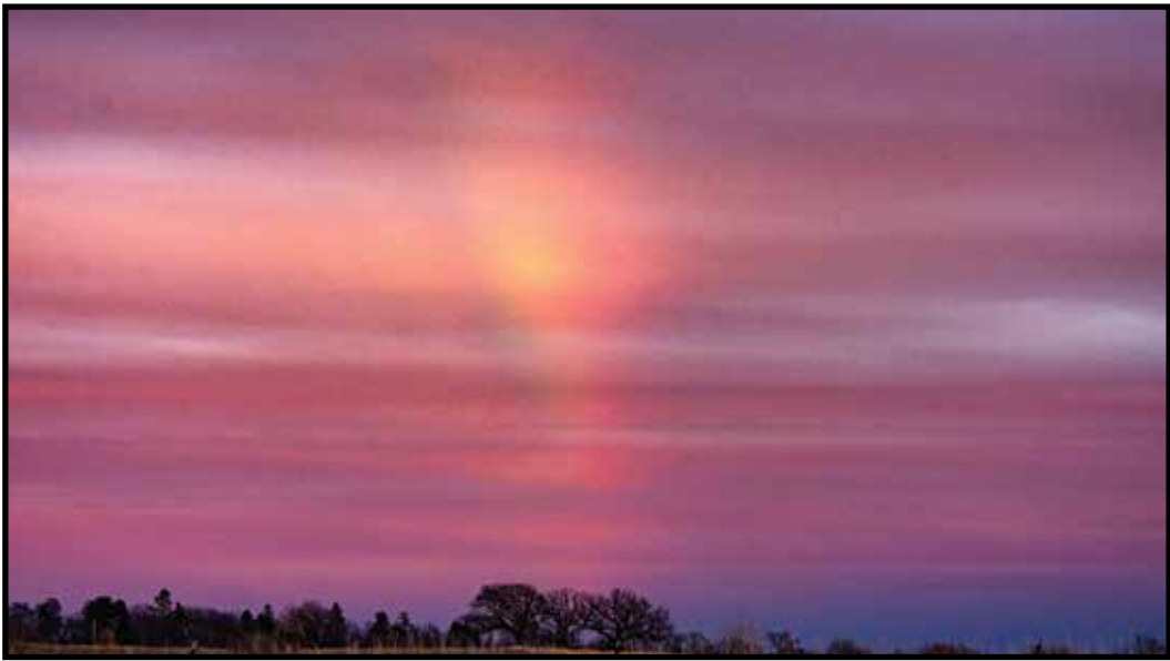
Looking east, at sunset, November rainbow..