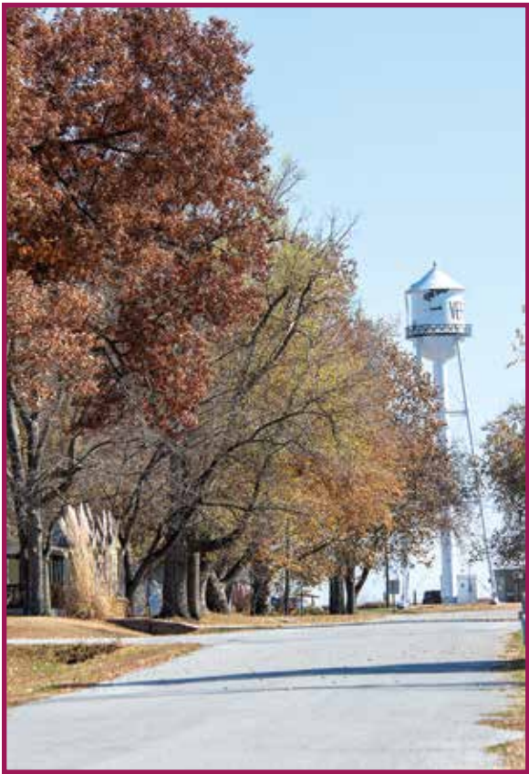
Street in Verdon, Nebraska.

Auburn • Brownville • Cook • Falls City • Johnson • Nebraska City • Nemaha • Peru • Rock Port • Syracuse • Tecumseh • Verdon