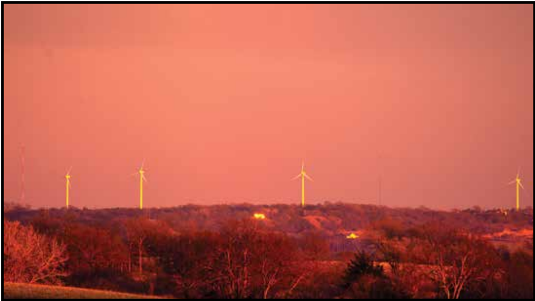
15 miles east, Rock Port Windmills seen at Sunset, from H-67.