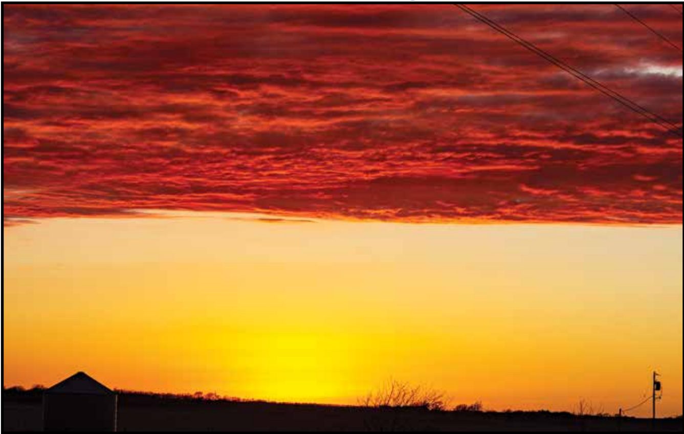
Sunsets often illuminate interesting cloud formations.