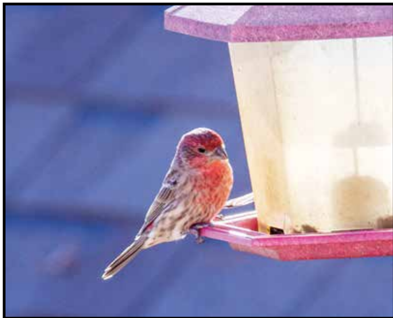
The House Finch's red plumage is often subtle, but in the Spring it's song is almost as sweet as the Wren.

Keep up with local businesses and news of Christmas shopping specials this December. Please thank them for advertising in "Your Country Neighbor!"