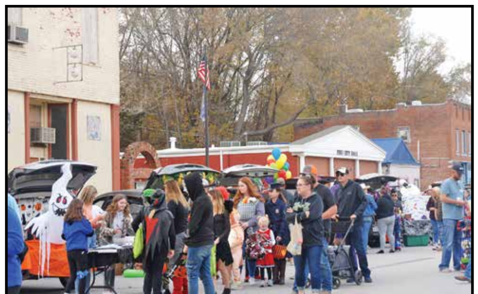
Peru's downtown was full of cute and spooky costumes.