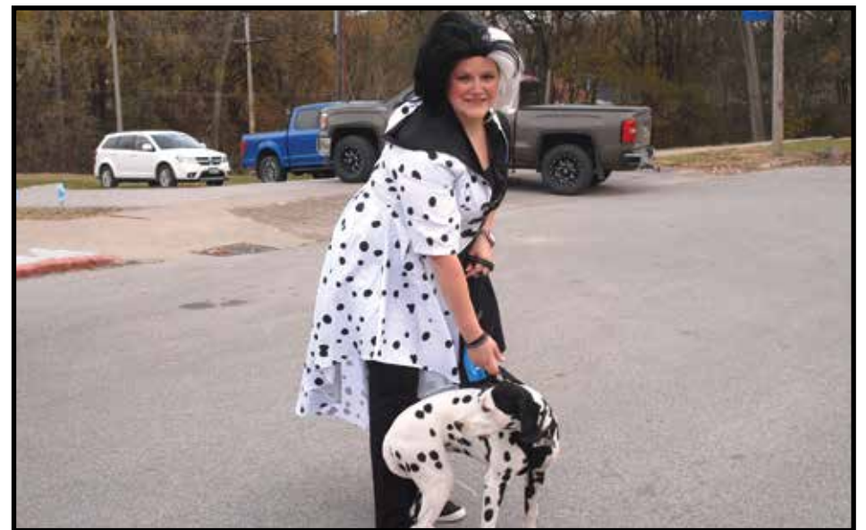
Oh no! Patch was caught by Cruella.