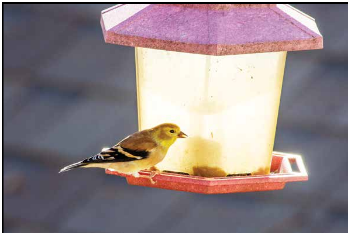
The Godfinch is changing to its Winter plumage.

Find a location near you at AKRS.com/locations