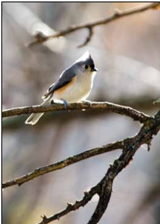
Winter birds are easily spotted on bare branches.

A Magazine for Small Towns and Rural America