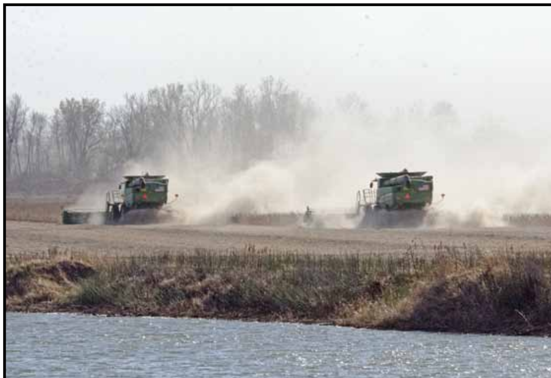
Harvesting was a common sight in November.