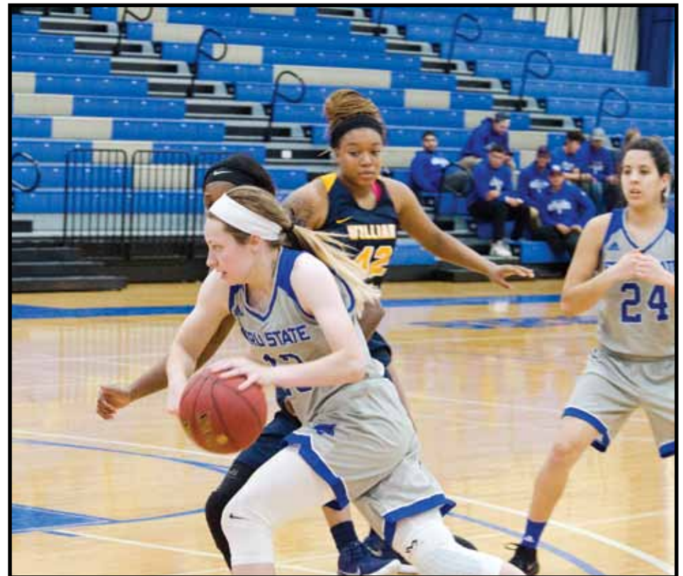
Collegiate Basketball, Peru State College v William Penn University, December 2, 2017