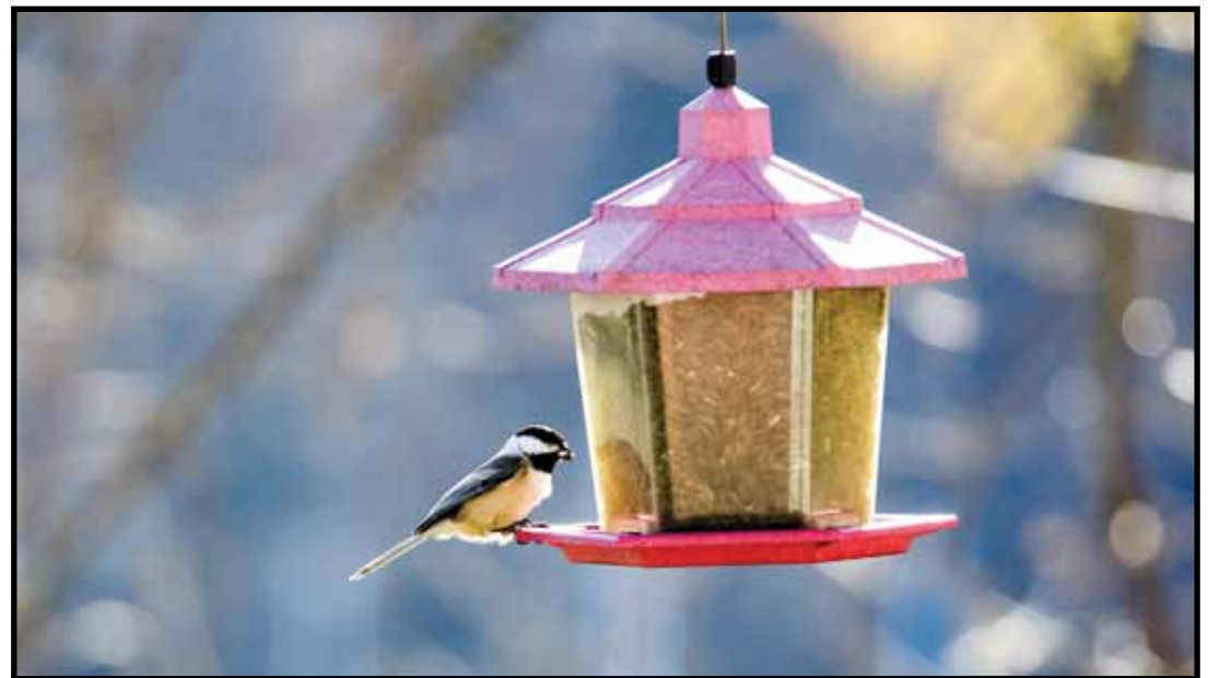
The Chickadee is a familiar backyard visitor.