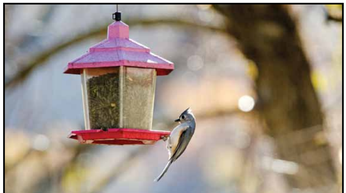
The Titmouse is another common visitor to area feeders.