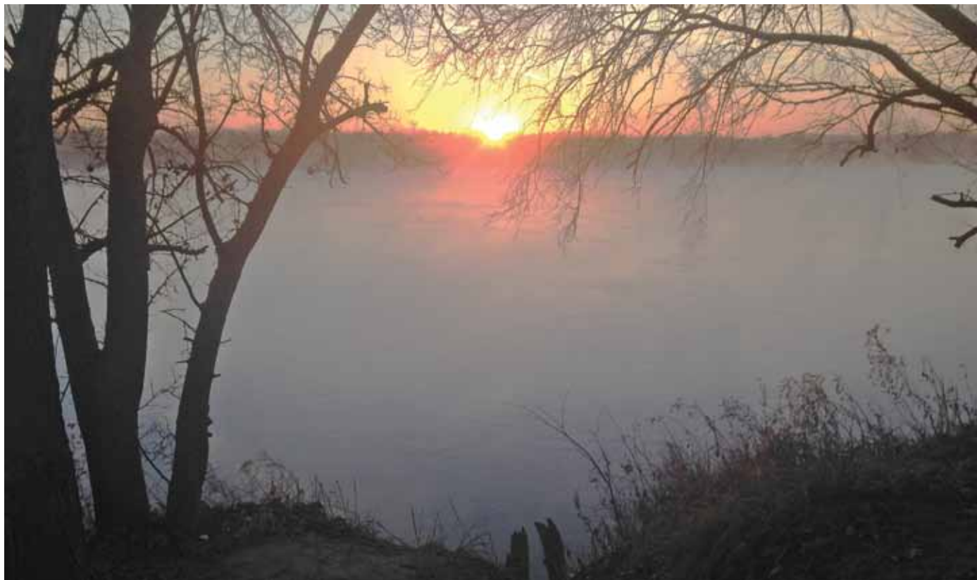
Sunrise over the Missouri River, November 2017