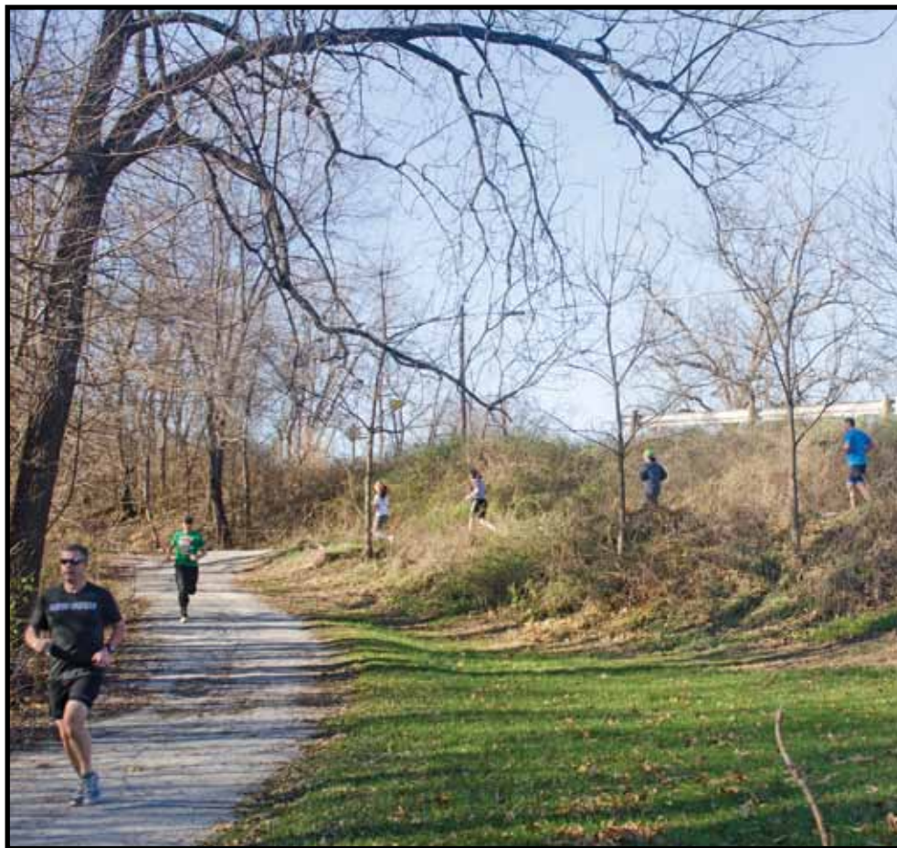
The Steamboat Trace Connecting Trail Part of the annual 5K Fun Run/Walk on December 2, 2017.

402-825-4601 702 Main Street www.whiskeyruncreek.com Brownville, Nebraska 68321