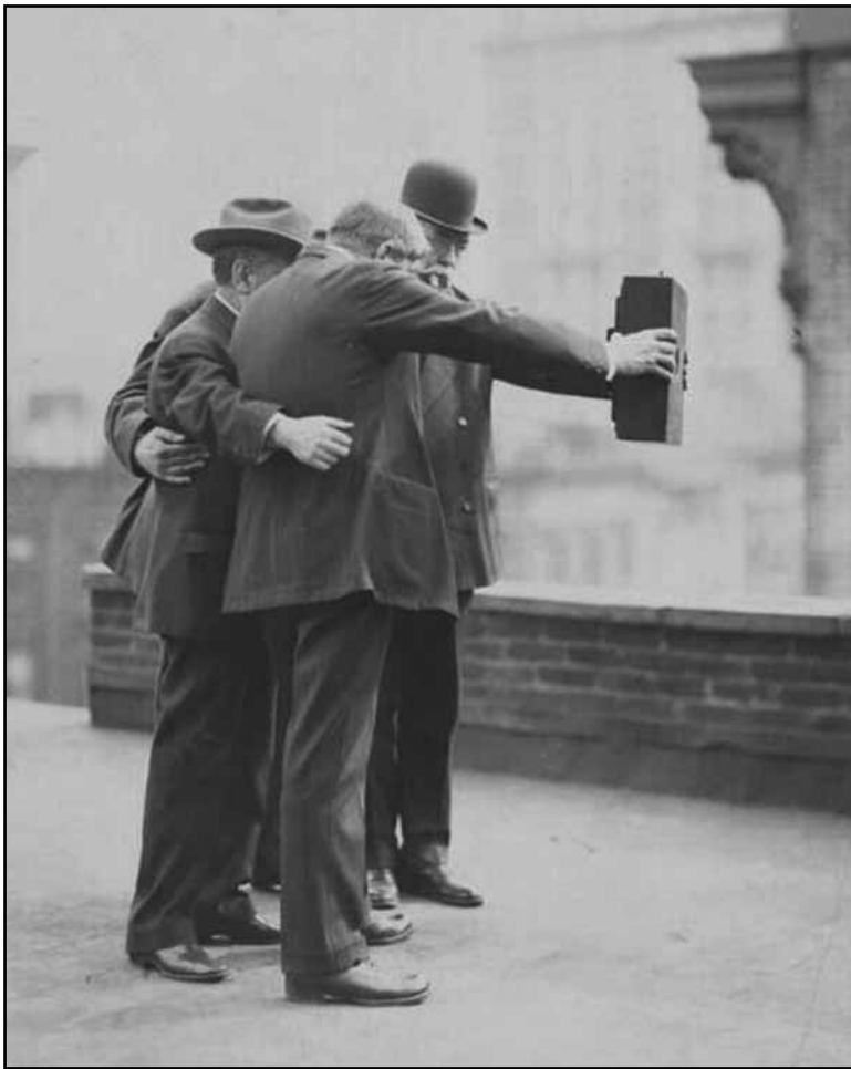
The first 'Selfie', New York, almost 100 years ago.