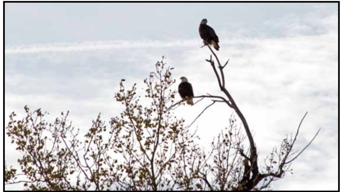
Bald Eagle with either her mate (or an 'offspring'); near river bridge north of Auburn.