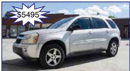
2005 Chev Equinox LT AWD