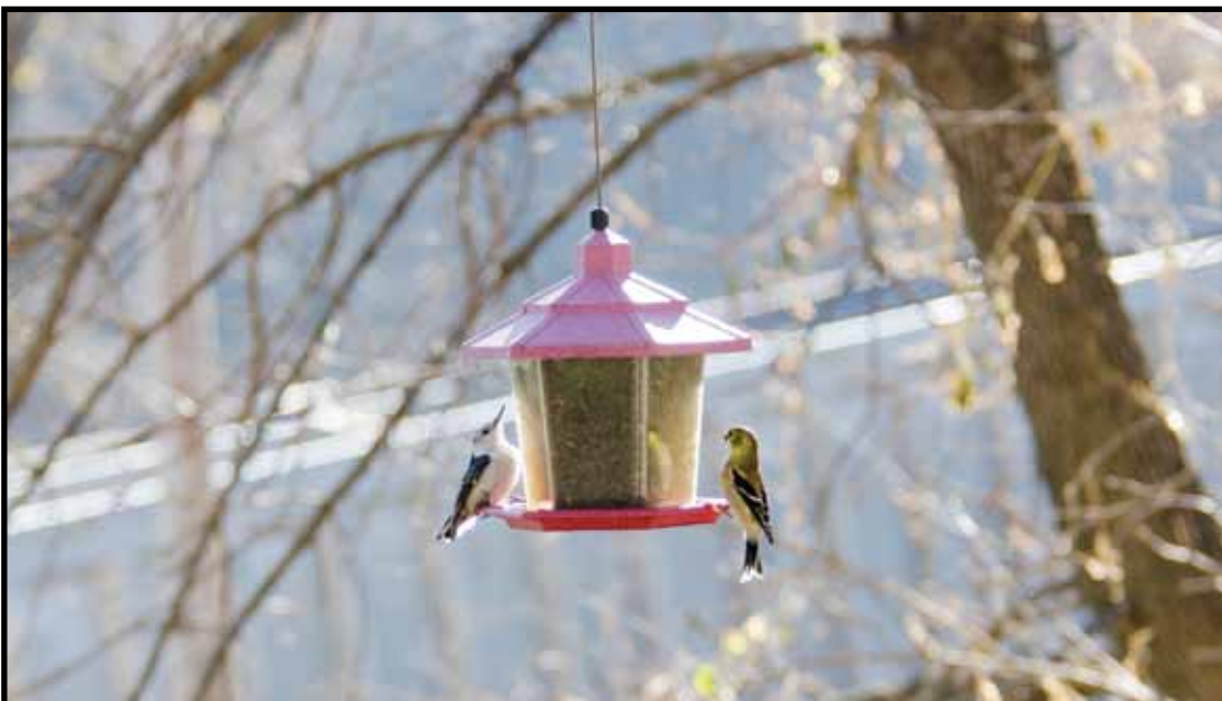
The Nuthatch in a rare 'upright' position; the Goldfinch is not so gold this time of year.