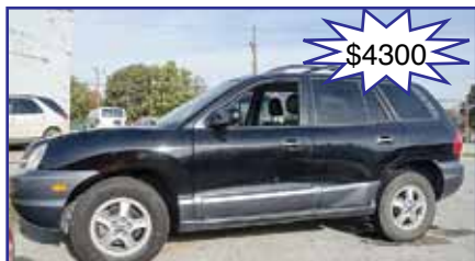
2004 Hyunda Santa Fe