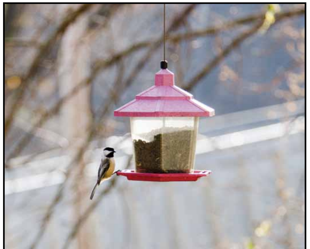
The Chic-a-dee is a partner in crime, as is the Titmouse, page 14.

Open 8:00 AM - 5:30 PM Monday - Friday (402) 274-3614 2000 N Street Auburn, Nebraska