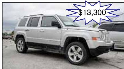
2011 Jeep Patriot 4x4