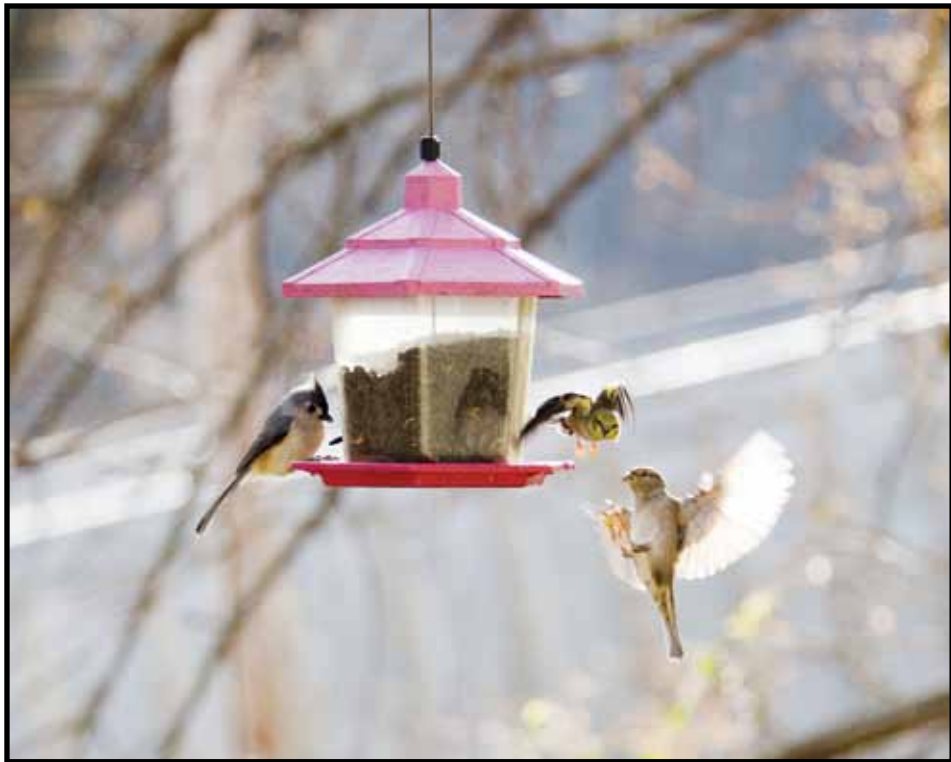
The feeder can be a busy place on a cold day.