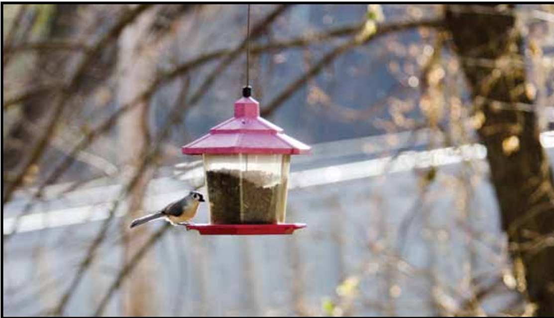
The Titmouse 'hangs out' with the Nuthatch and the Chic-a-dee