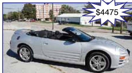
2005 Mitsubishi Spider GT