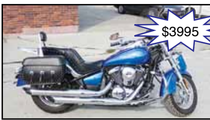
2009 Kawasaki KZ 900