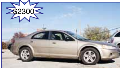
2002 Dodge Stratus

814 Central Ave. Auburn, Nebraska 68305 Call 402-274-2277 Visit www.TincherAutoSales.com