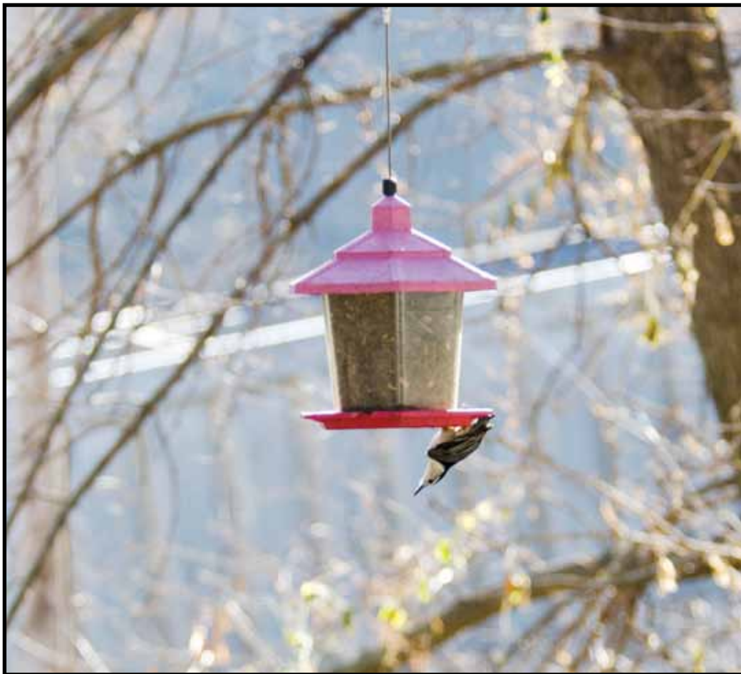
The Nuthatch is an entertaining bird.