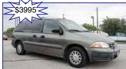
2000 Windstar LX - Low Miles!