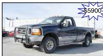
1999 F250 Super Duty Diesel XLT