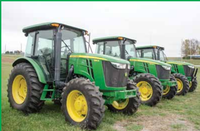
16F/16PR, 3 Rear SCV, 3 Mid SCV, 18.4R30 Rear Tires, 12 4R24 Front Tires, Corner Exhaust, Radio, 228 Hours, Cold Weather Package