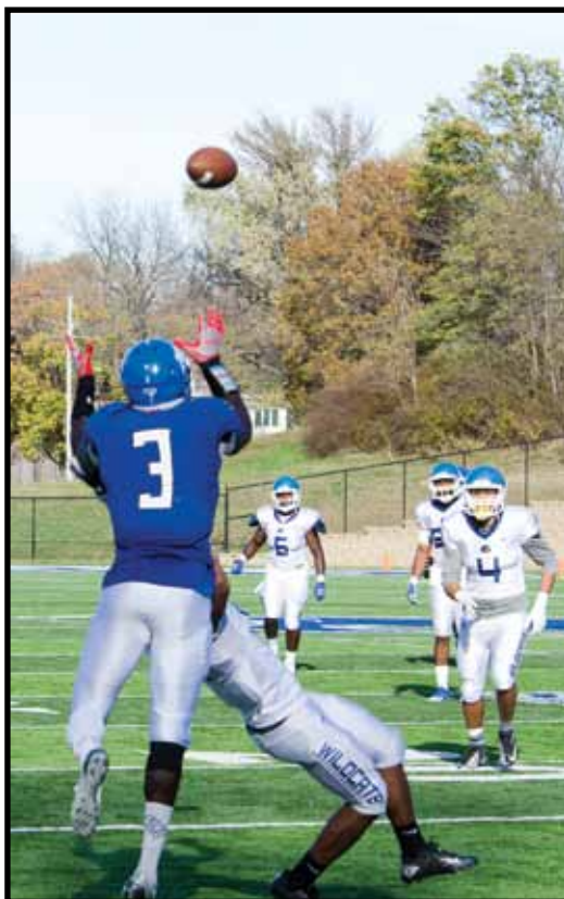
See Completion on page 6.