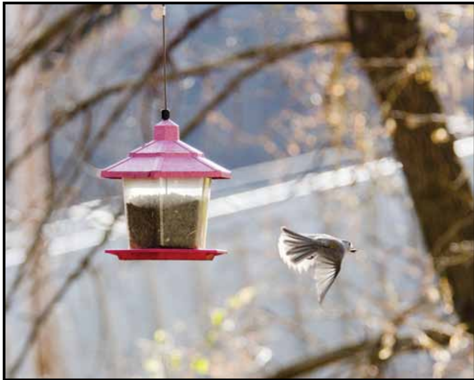
The Nuthatch is off to a branch to eat his snack.

John Deere - Honda - Toro Mowers in Inventory