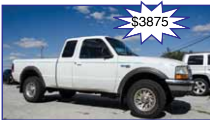
1998 Ford Ranger XLT 4WD