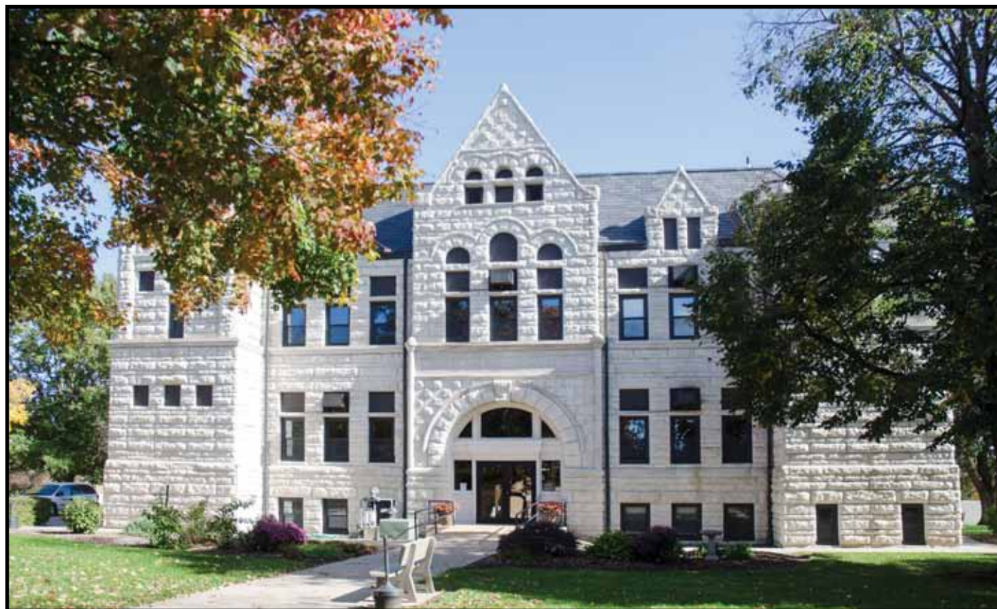
Nemaha County Courthouse, November, 2016