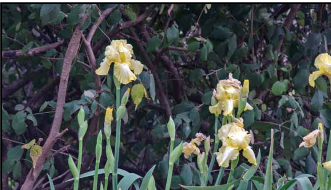
November 18th, Main Street in Brownville. How did they do this??