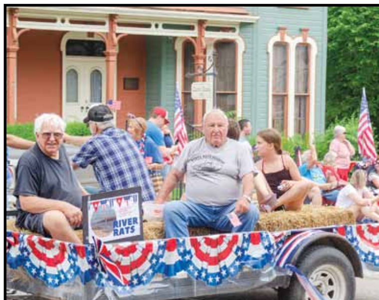
The "River Rats" celebrate 37th anniversary of their formation in 1982.

The Distillery Is Operating At Whiskey Run Creek Winery