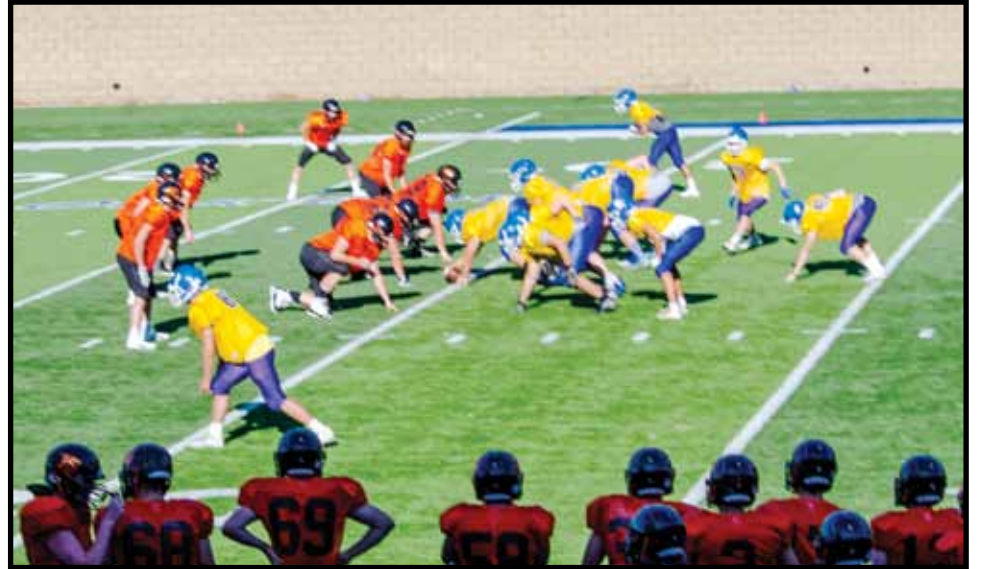
Falls City vs North Platt