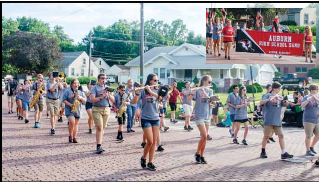
Auburn High School Band