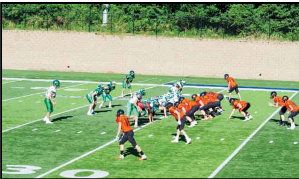
Wilber-Clatonia vs Falls City