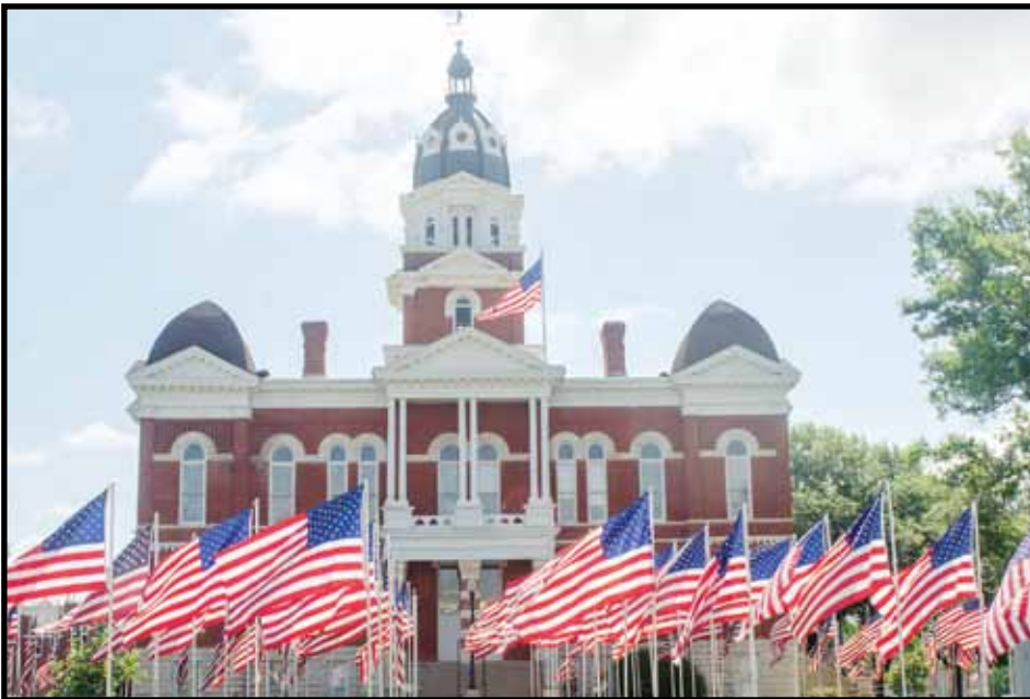
Johnson County Court House in Tecumseh, July 3rd.