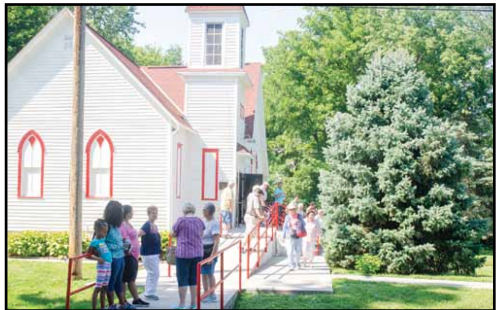
Plays at this Summer Theatre run through August 11.