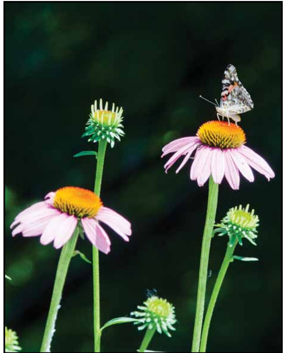
Painted Lady on Coneflower