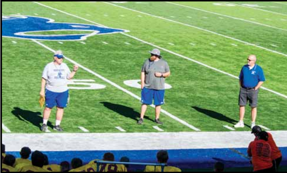
Peru State College hosted high school training camps throughout the Summer. Above, the PSC football coaches introduce the evening program.