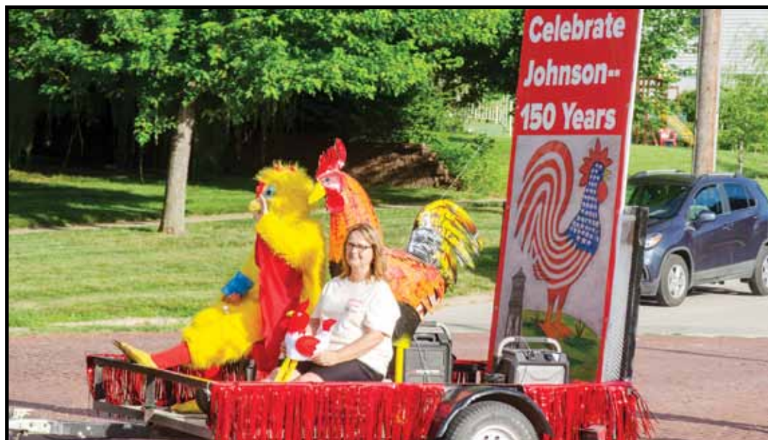
Celebrate Johnson -- 150 Years