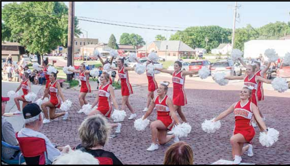
Auburn High School Cheerleaders