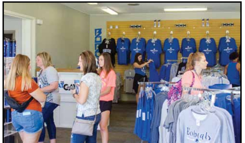
Orientation days were opportune times to shop for Fall apparel in the Student Center "Cat Cave".