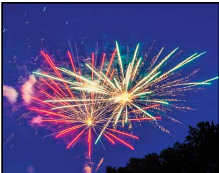
Brownville's fireworks display is impressive every year.