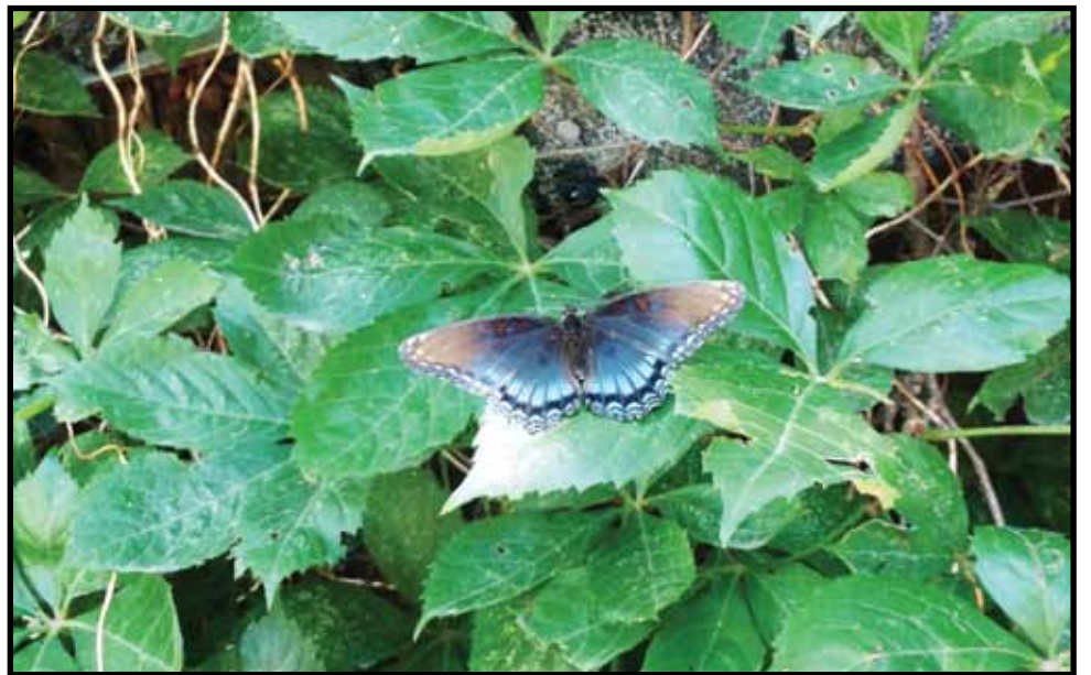
No photos of Monarchs yet this year. This is a "Red-spotted Purple".