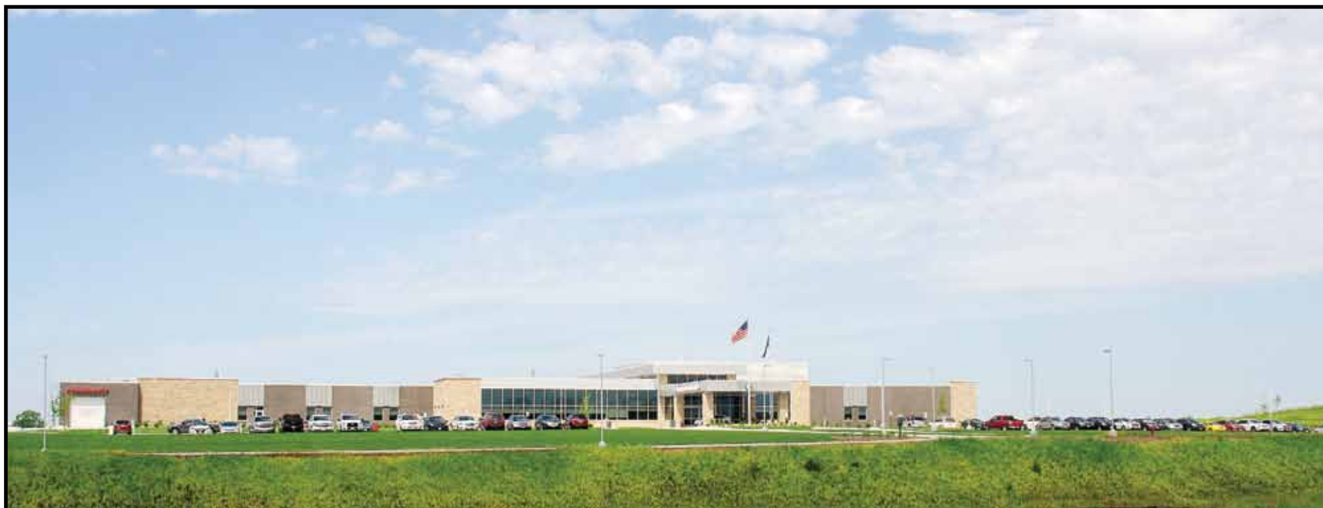
New Hospital in Syracuse