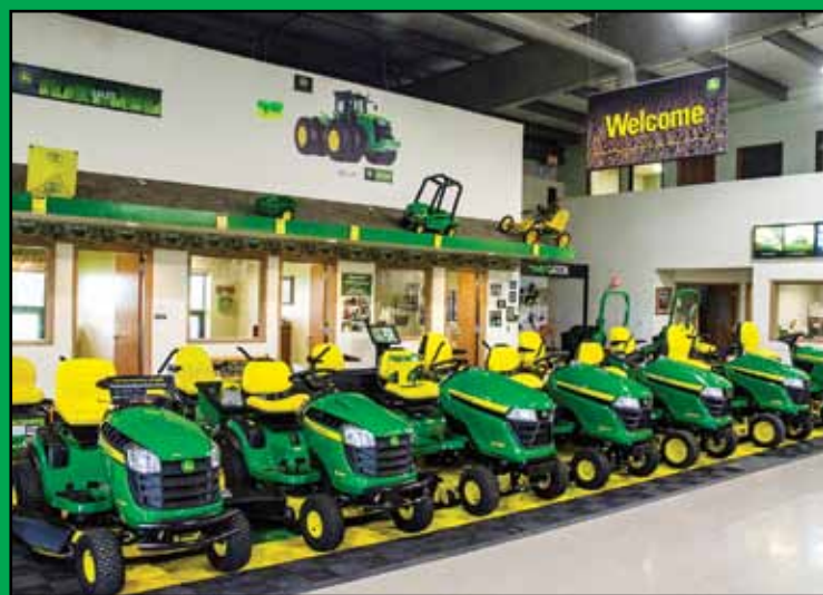
John Deere, Honda, and Toro Mowers in Inventory.