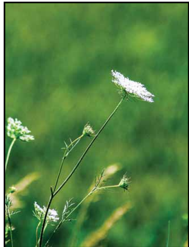
Queen Anne's Lace