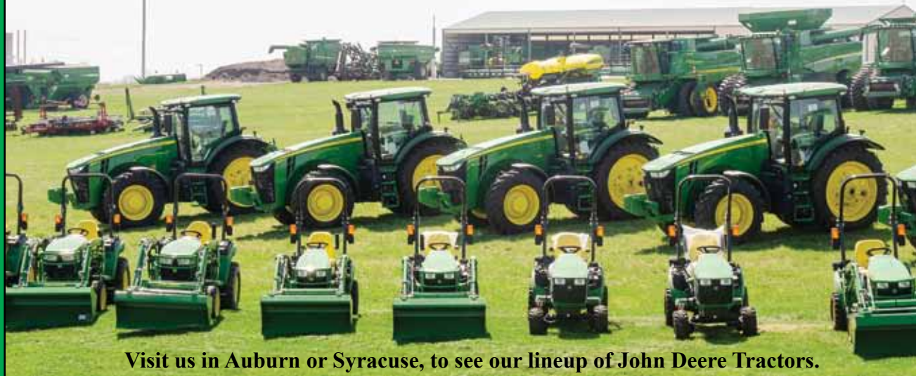
Visit us in Auburn or Syracuse, to see our lineup of John Deere Tractors.