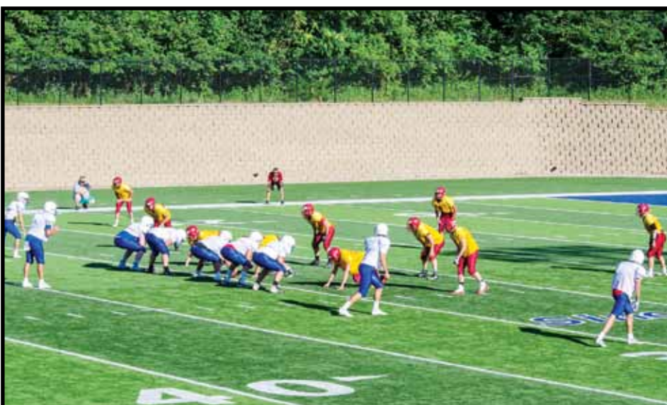
Morrill vs Conestoga