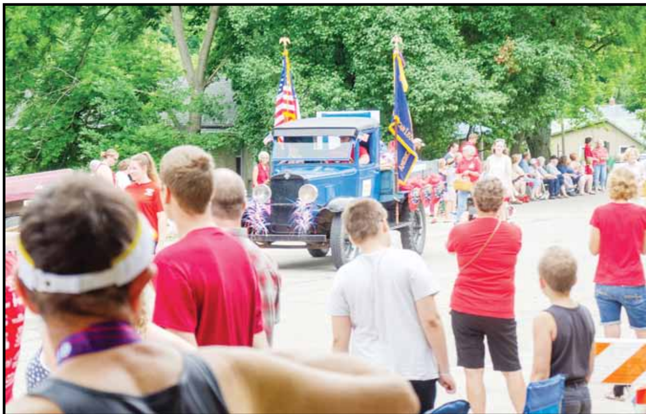
Everybody Loves a Parade! This one in Brownville, Nebraska, July 4th.