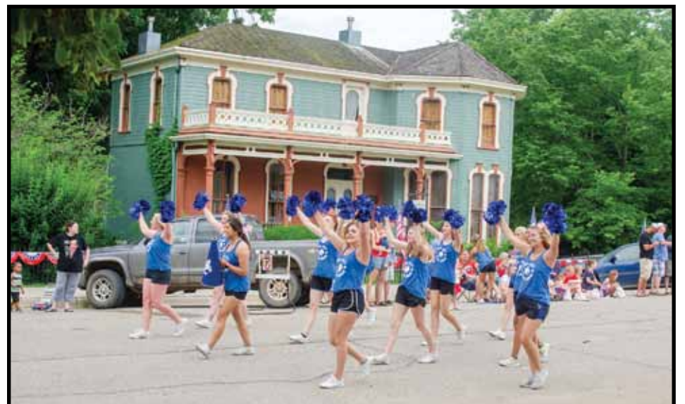
The PSC Cheer Squad in Brownville's Freedom Parade on July 4th.