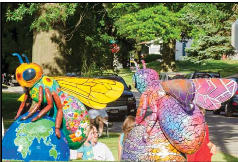
These bees are creating some buzz around Nemaha County, Nebraska.