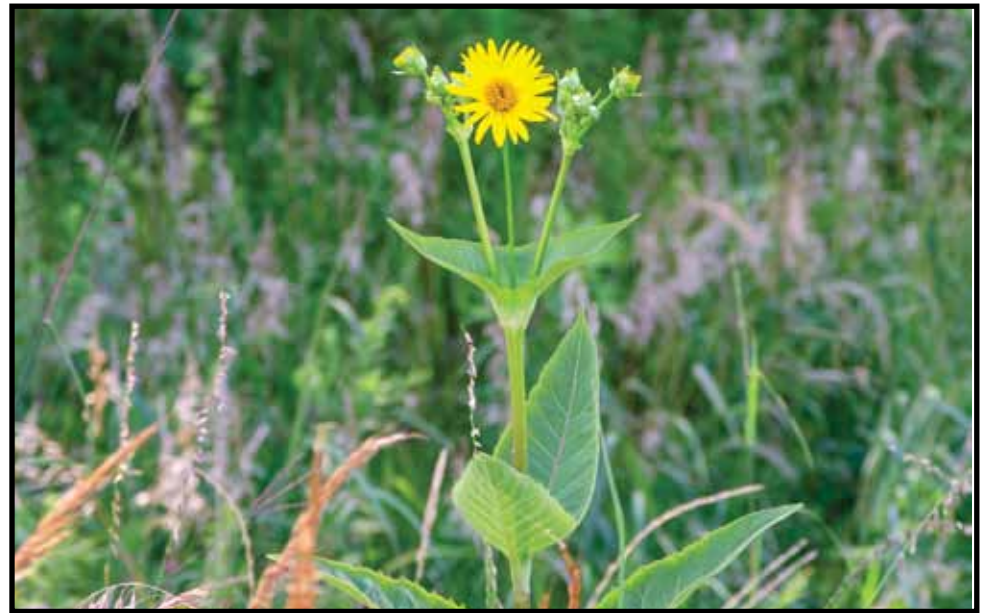
More of these along H-75, but this one from H-67 was a better image.

It's hard to fight those seasonal things that September brings. Labor Day, football, and back-to-school all 'feel' like Fall, even with green trees and eighty degrees! So I'll just go with the flow. I'll enjoy the cool nights, the late Summer colors, and the anticipation of more colors this Fall. Plus for now and for several weeks more, my window on Fifth Street shows me everyday, Summertime!