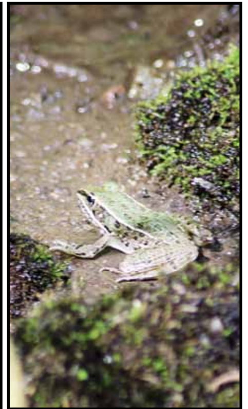
Photographed along the Steamboat Trace on July 30, 2016