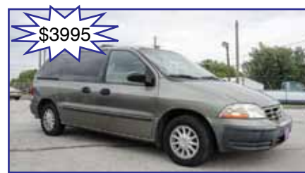
2000 Windstar LX - Low Miles!