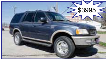
1998 Ford Expedition/Ed Bauer Pkg.

COMPLETE AUTO SERVICE AND REPAIR ALL MAKES AND MODELS