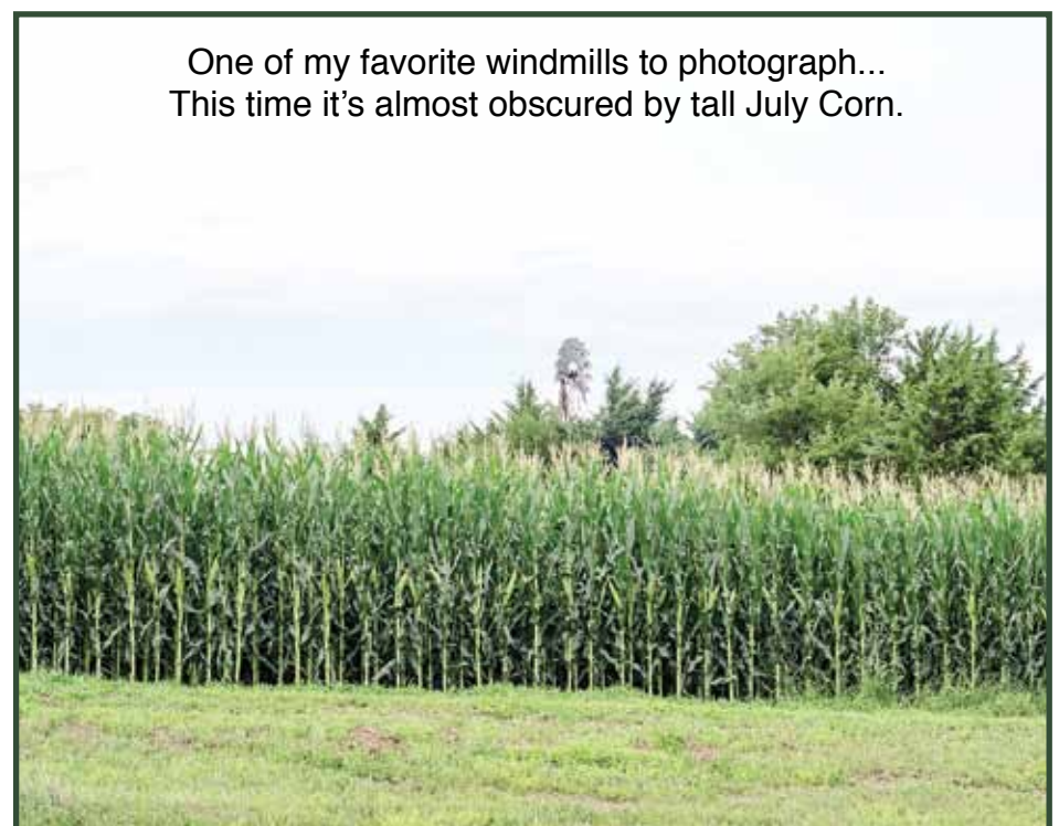
One of my favorite windmills to photograph... This time it's almost obscured by tall July Corn.

Holidays and vacations are fun but it is always good to come home to where life is especially good and relatively safe. God bless America.