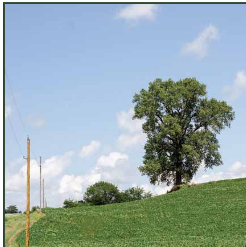
Alice's Cottonwood, on Hwy 67, near Peru.