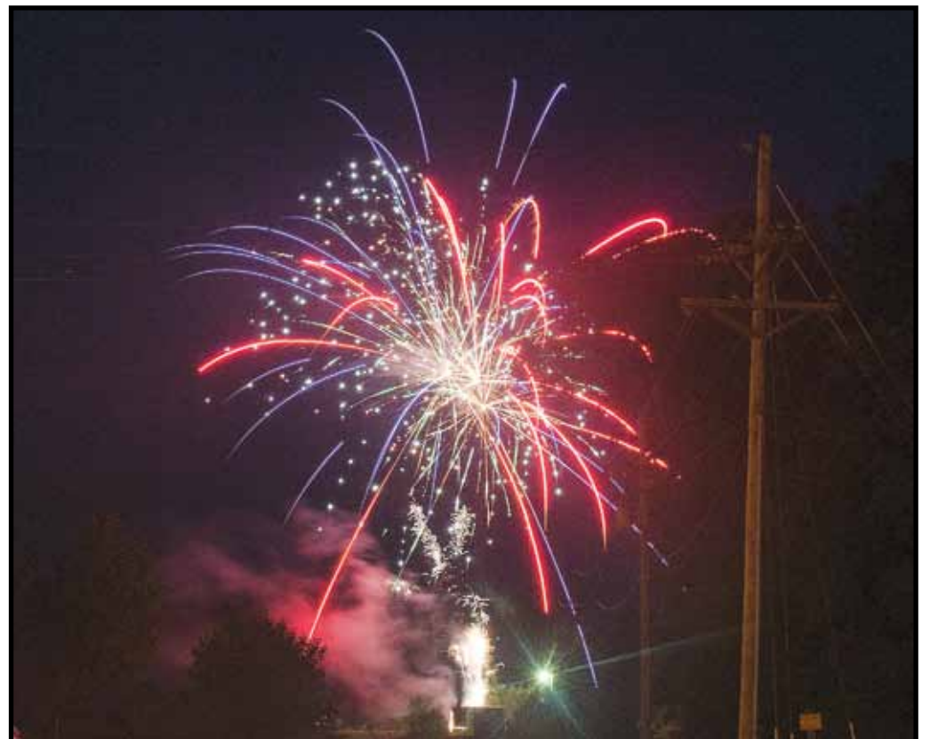
July 4th, Brownville, Nebraska