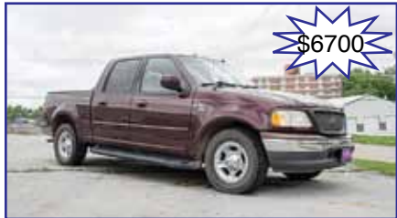
2001 F150 4x2 SuperCrew