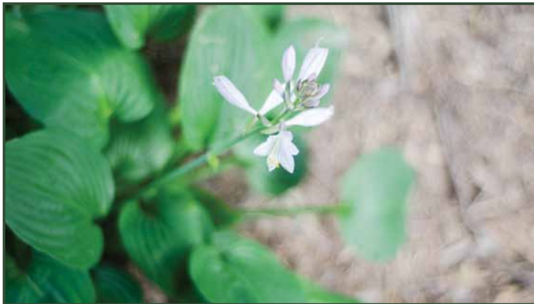
This delicate wildflower was photographed on the bank of the creek at the Whiskey Run Creek Vineyard and Winery in Brownville, Nebraska.