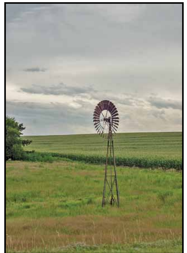
On the road to Lorton