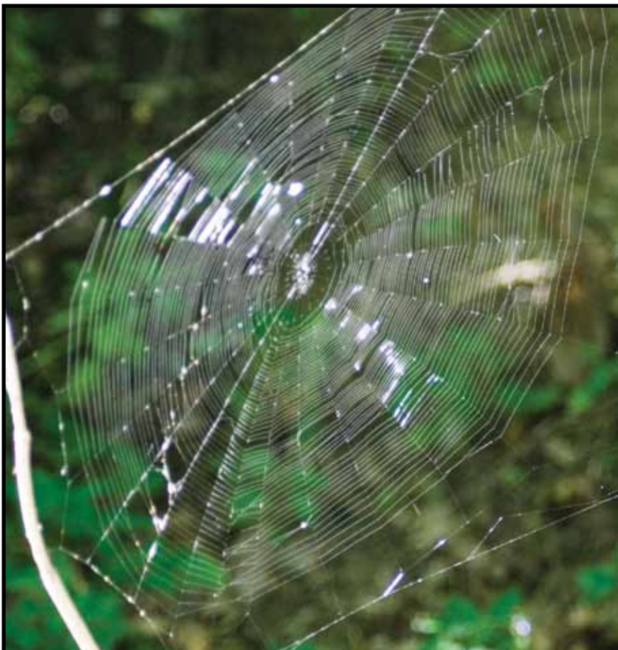
Spider Web along a morning trail