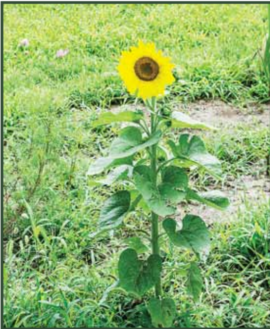
Sunflower in a Peru Garden

A Magazine for Small Towns and Rural America