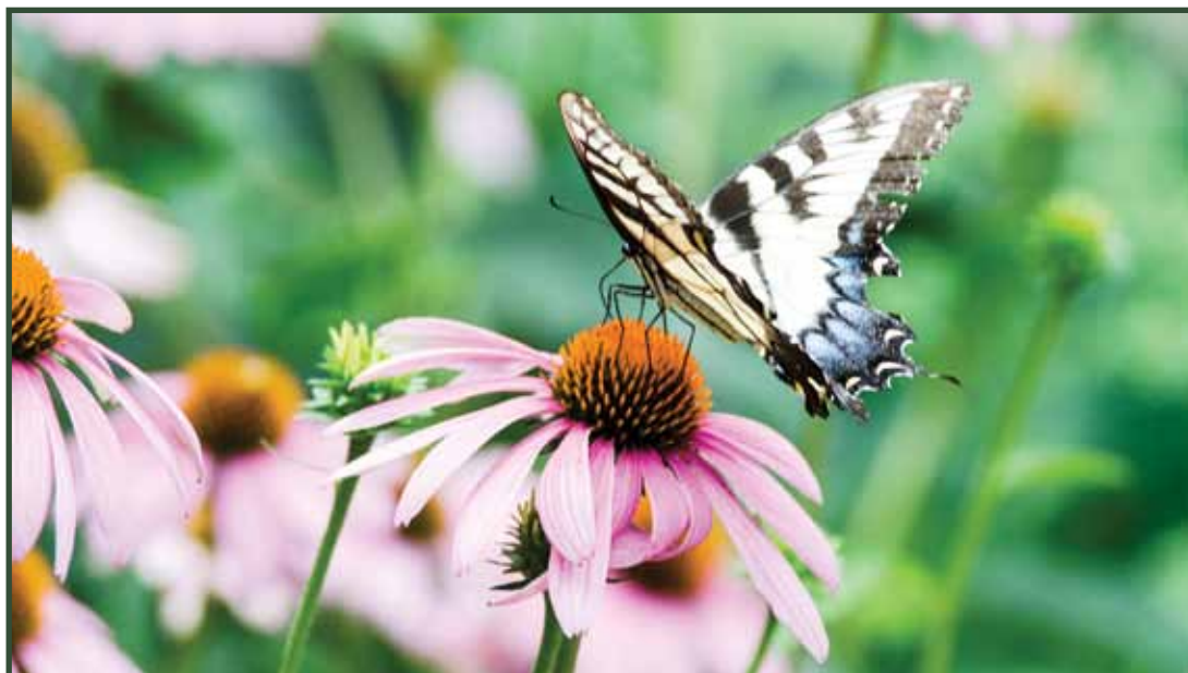
I finally got a photo of a Swallowtail this year. Here, in the flower garden of the "Little Red School House" in Brownville.