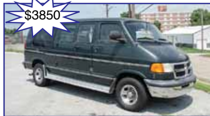
2002 Dodge Van - Low Miles!