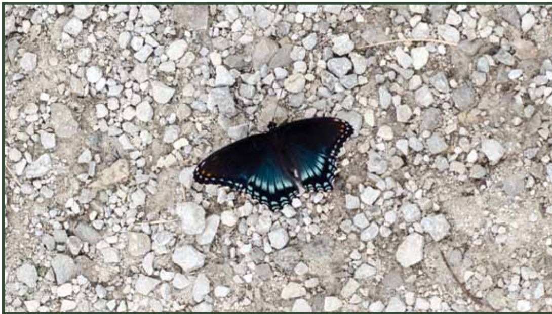
I've not seen many butterflies so far this year; maybe August? To learn more about this one, 'google' "Red Spotted Purple".