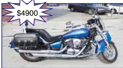
2009 Kawasaki KZ 900

Vehicles Not Shown 1988 F150 XLT Lariat 4x4...$1900 2006 Buick Rendezvous.....call us