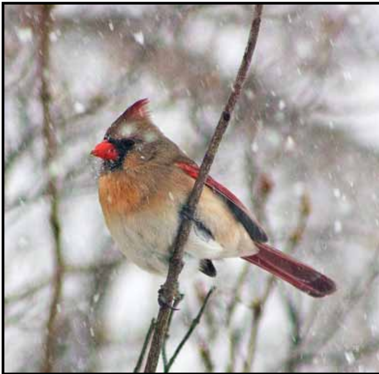
This Female Cardinal's Spring plumage is especially vivid.