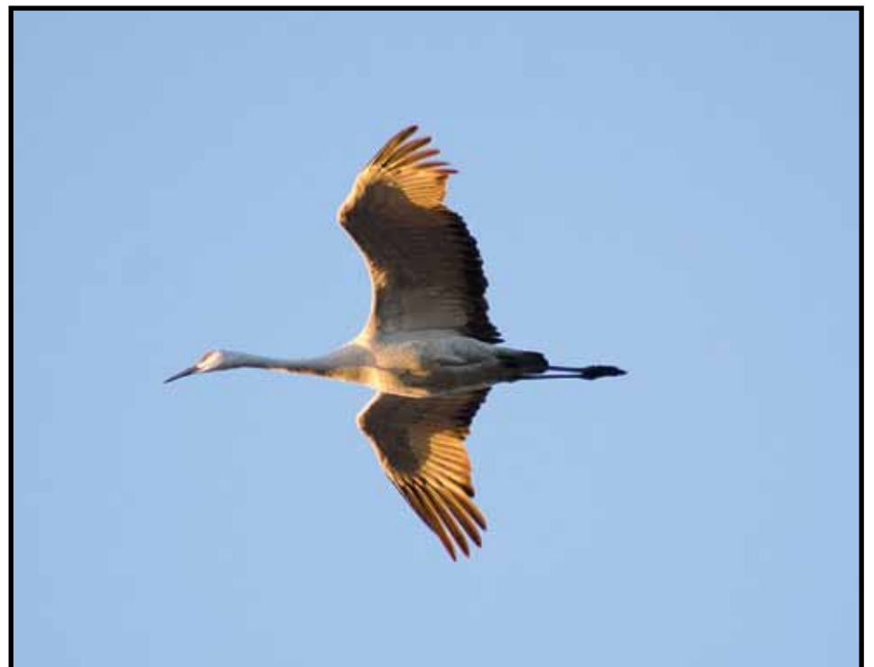
Sandhill Cranes near Kearney, Nebraska, March 20, 2015