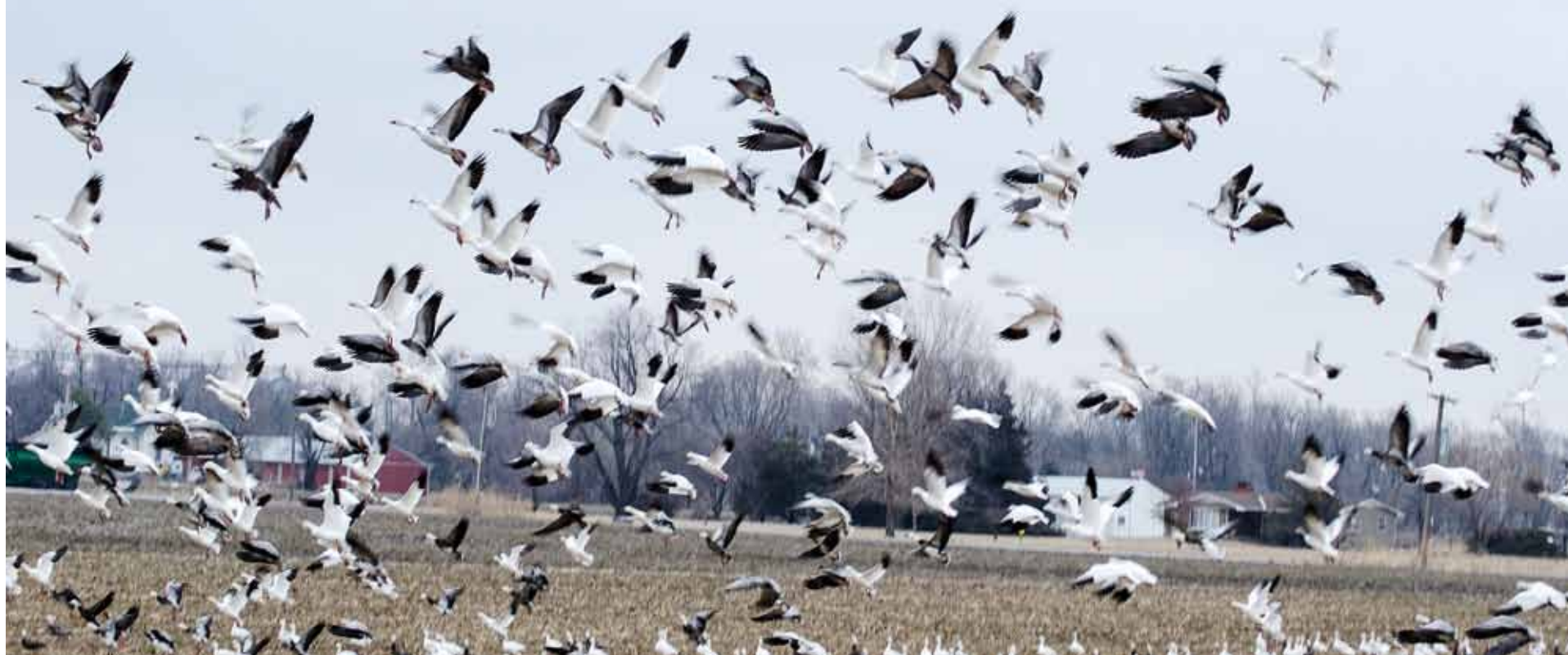
Snow Geese rise up from feeding east of Rulo, near Big Lake, early March.

Snow Geese East of Rulo, early March, 2015