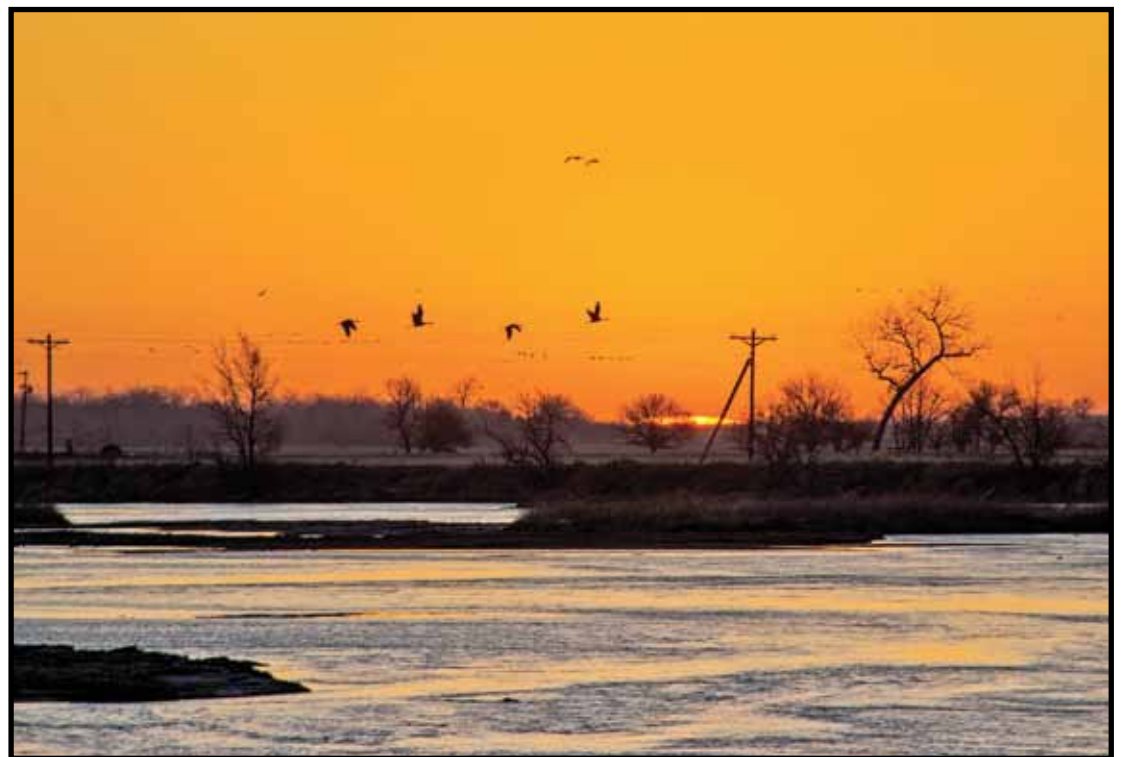
Sandhill Cranes at Dawn, March 21, 2015, near Kearney, Nebraska