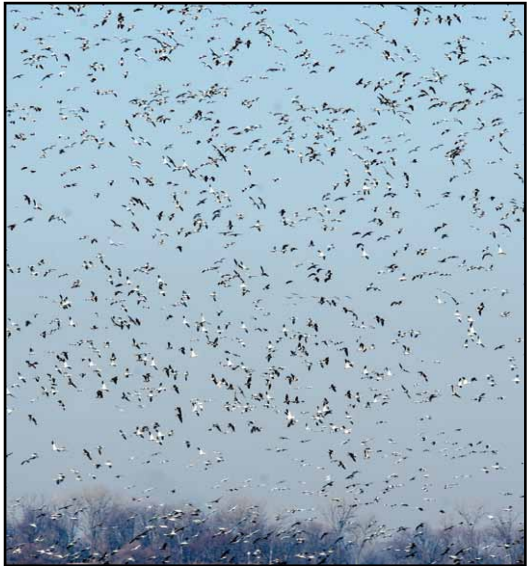
Snow Geese at Squaw Creek National Wildlife Refuge Near Mound City, Missouri, mid March

Open 8:00 AM - 5:30 PM Monday - Friday 2000 N Street Auburn, Nebraska (402) 274-3614