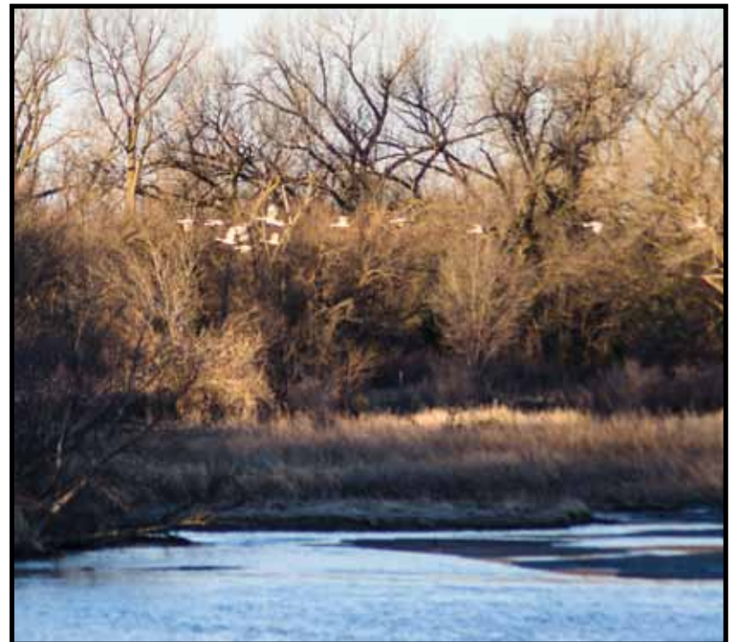
Just after Sunrise, Cranes leaving Platt River roost Near Kearney, Nebraska, March 21, 2015

402-825-4321 228 Main Street Brownville, Nebraska Like Us on facebook.com/BrownvilleLyceumCafe