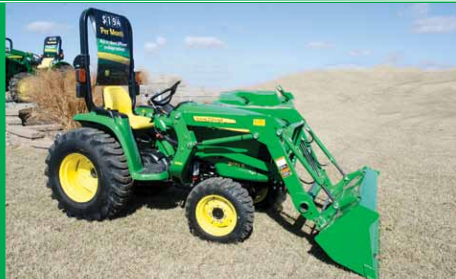
John Deere - Honda - Toro Mowers in Inventory

Large Enough To Accommodate You, Small Enough To Appreciate You.