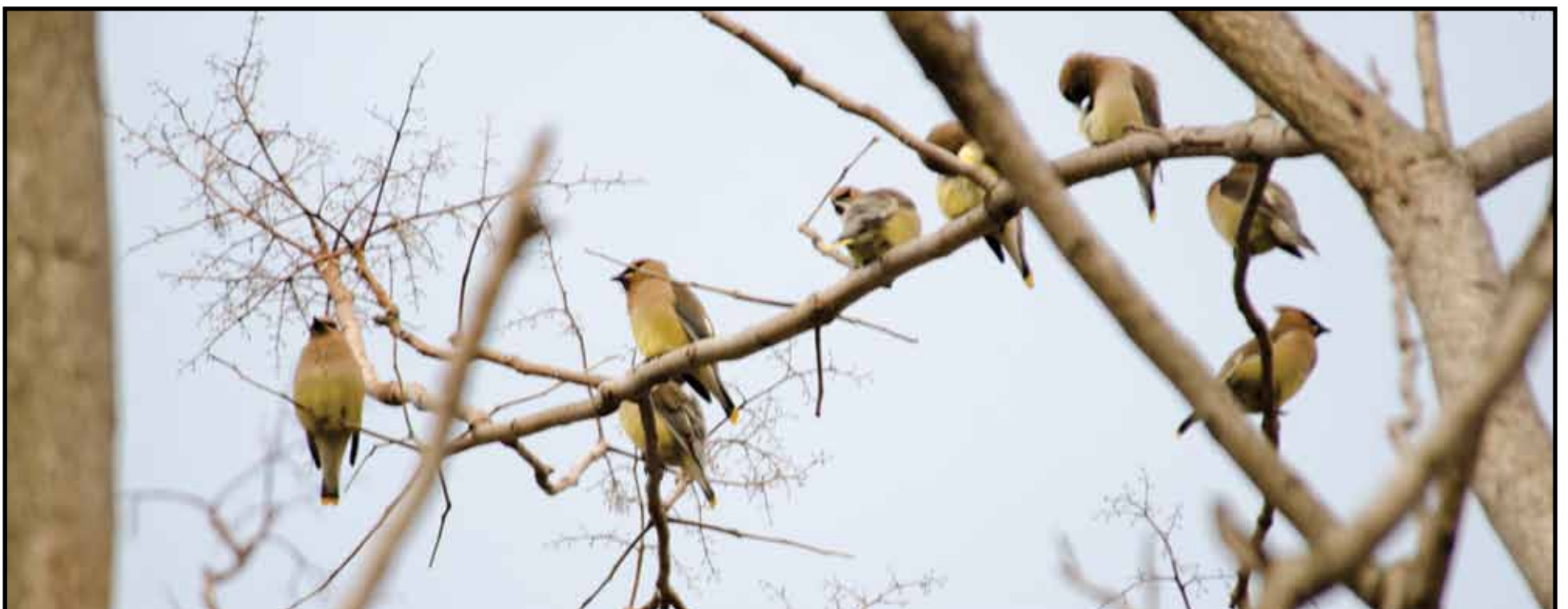
I missed the 'Stopover' of the Cedar Waxwings at the Auburn Courthouse Square this Spring. I spotted these few in the treetops in my yard, 3/24/2017.