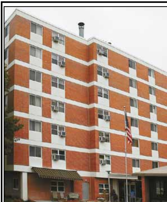
Valley View Apartments (High Rise) • 1017 H Street • Auburn, NE