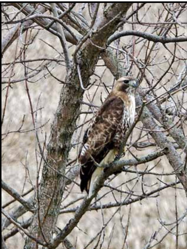
Red-tailed Hawk along H-67 West of Peru

814 Central Ave. Auburn, Nebraska 68305 Call 402-274-2277 Visit www.TincherAutoSales.com