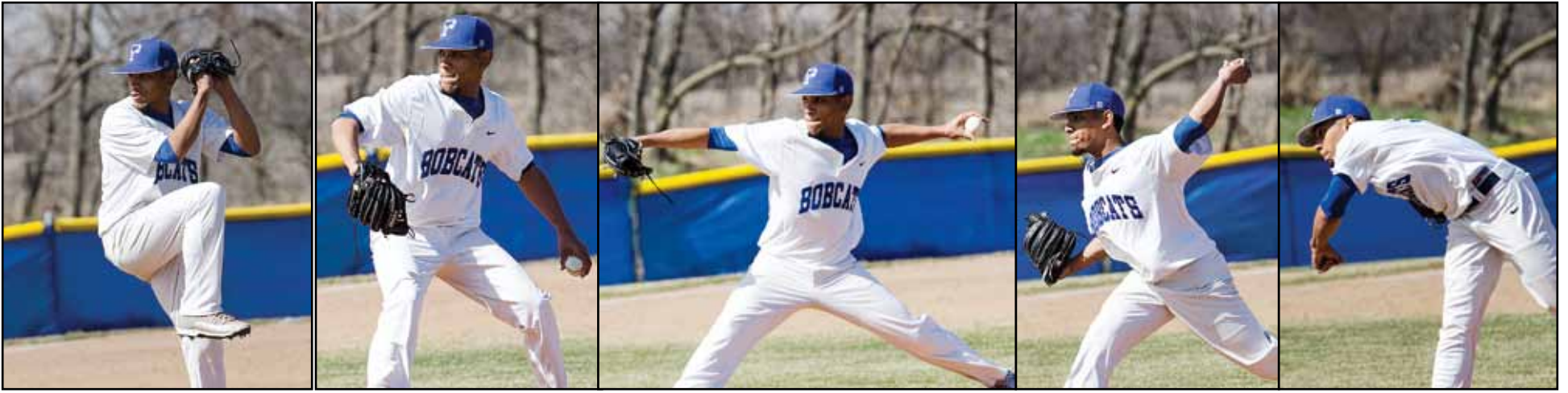
Some Peru State College Pitching