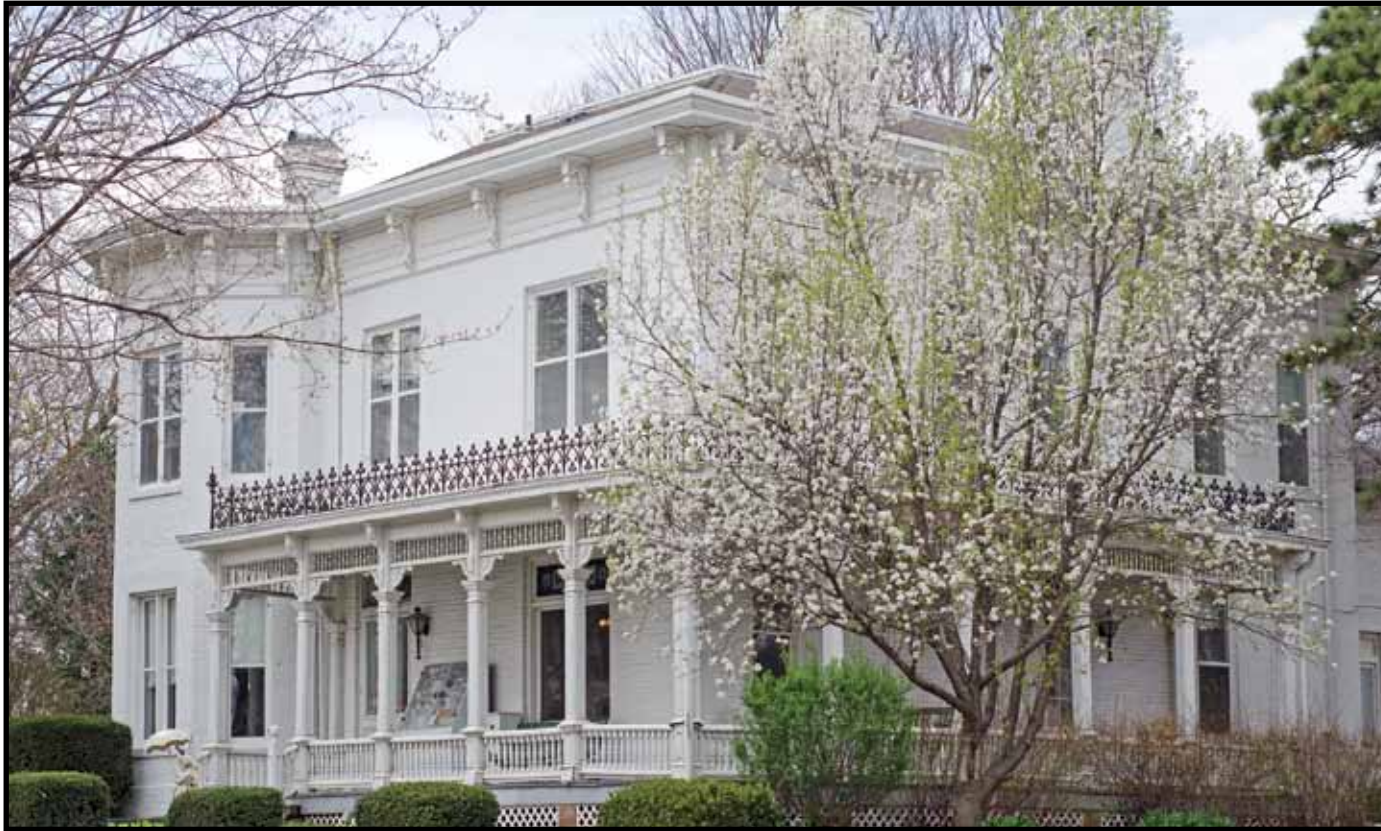
Nebraska City Chamber of Commerce

Auburn • Brownville • Cook • Falls City • Hiawatha • Johnson • Nebraska City • Peru • Rock Port • Sabetha • Syracuse • Tecumseh